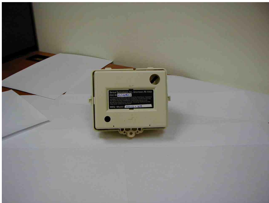
Figure 4 Rear View