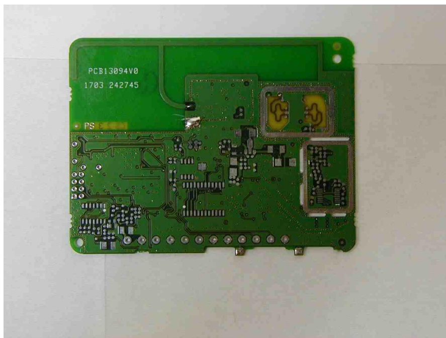
Figure 8 PCB Shields Removed