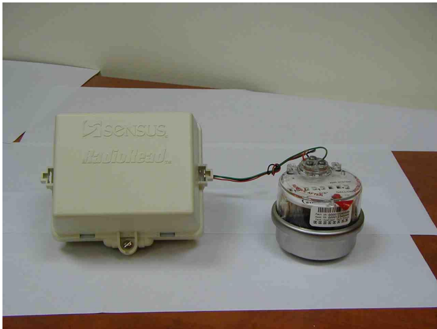
Figure 2 Transmitter Connected to Water Meter