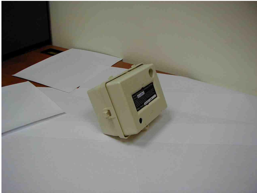
Figure 3 Rear Side View