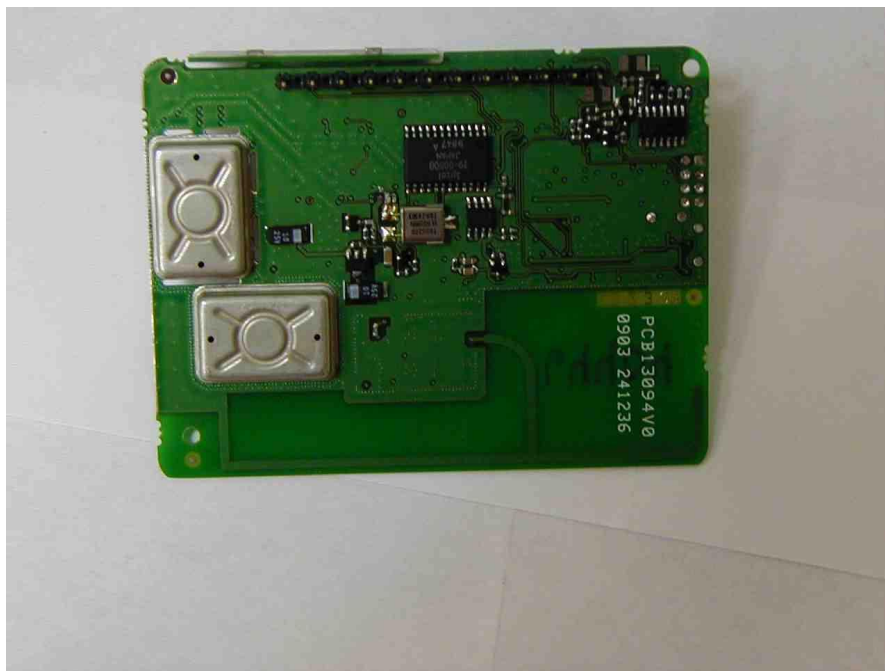
Figure 6 PCB Side 1