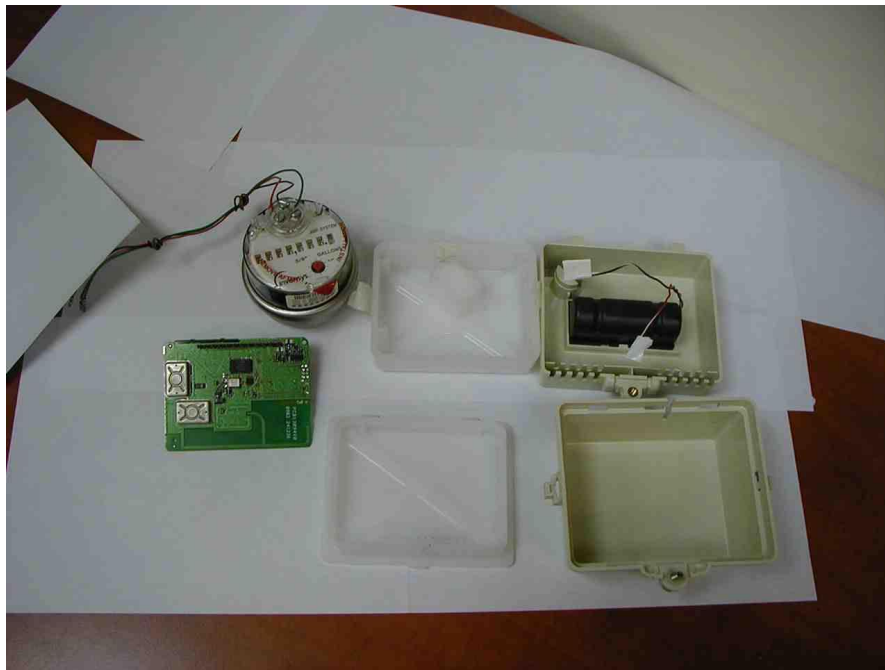
Figure 5 Transmitter Unit Open