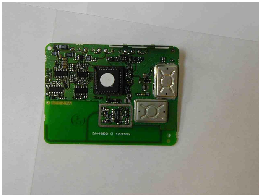
Figure 7 PCB Side 2