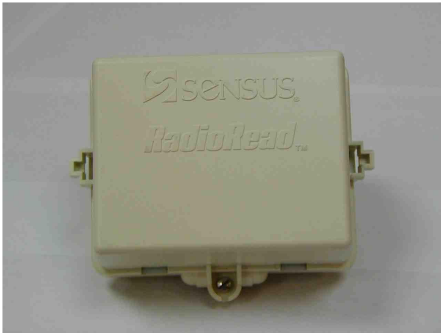
Figure 1 Top View External