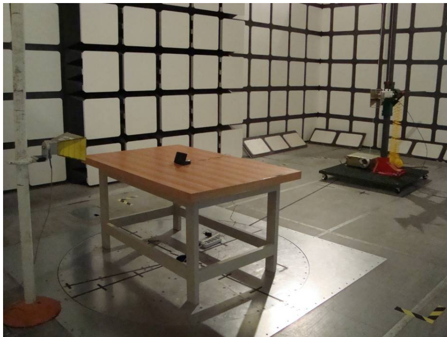
Spurious Emissions - Rear View (Above 1 GHz)