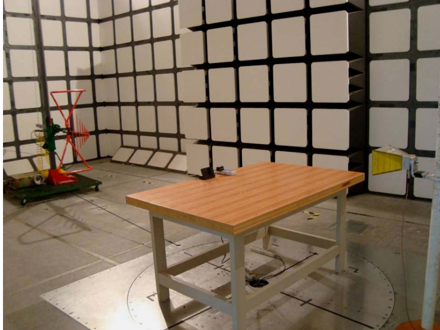
Radiated Emissions - Side View (30 MHz-1000MHz)