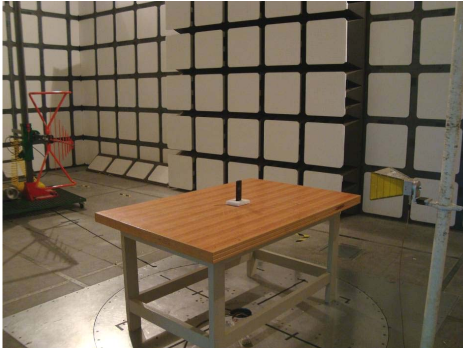
Radiated Emissions - Side View (30 – 1000 MHz)