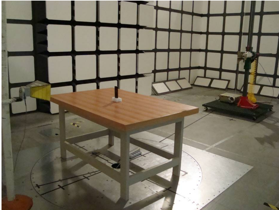
Spurious Emissions - Rear View (Above 1 GHz)