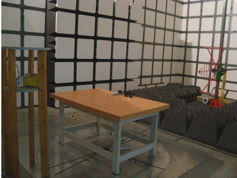
Radiated Emissions - Side View (30 -1000 MHz)