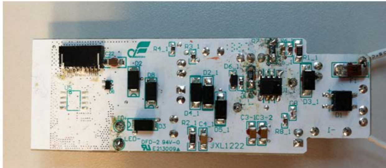
Bottom Side of the PCB