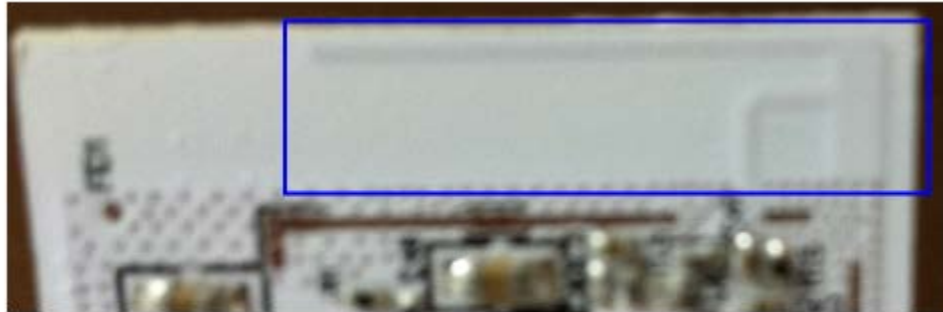
Zoomed in on the antenna.