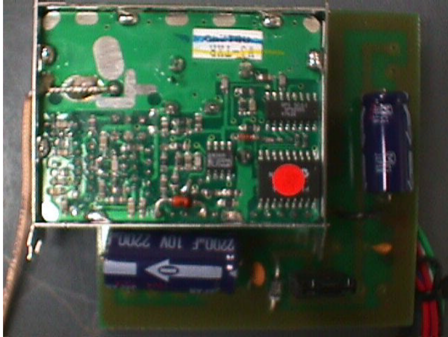
FIGURE 37: 10 TO 15 GHZ