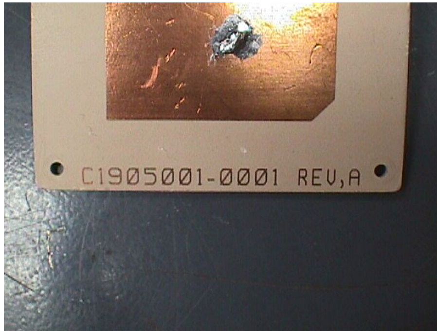
FIGURE 35: 10 TO 15 GHz