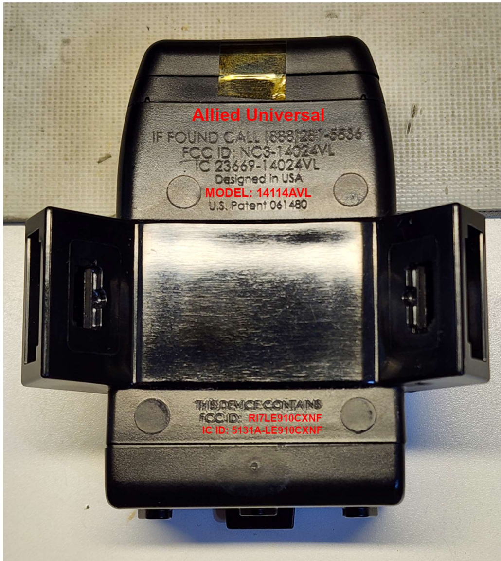
Underside of Unit, location of FCC and IC IDs