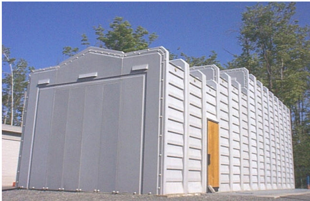
Fig. 1.b APREL's OATS (Open Area Test Site)