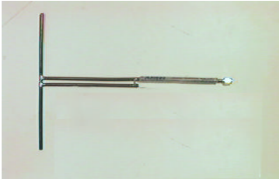
Reference Dipole Antenna Used for ERP Measurement