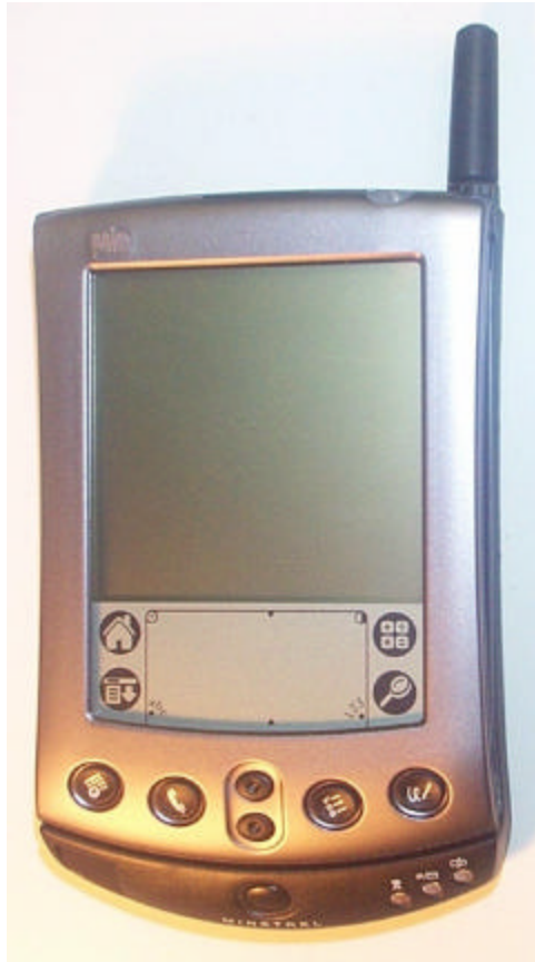
Novatel Wireless Minstrel m500