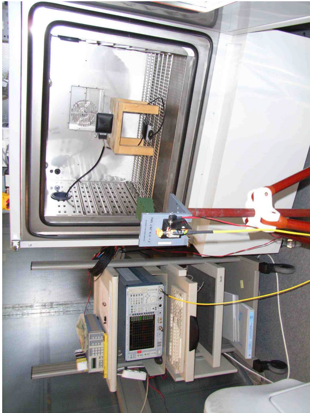
72572clima2.JPG: Test set-up climatic chamber

Annex A of Test Report R72572_BMW_FCC EUT: LCDAS Lane Change Decision Aid System Manufacturer: Hella KGaA Hueck & Co.