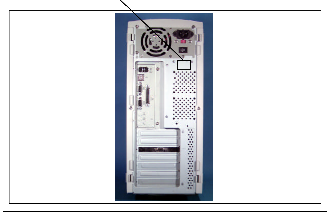
Fig 12. Sample label

The Label shown shall be permanently affixed at a conspicuous location on the device and be readily visible to the user at the time of purchase.