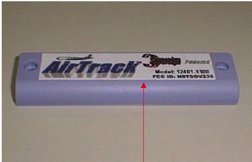
ATS2 FCC LABEL