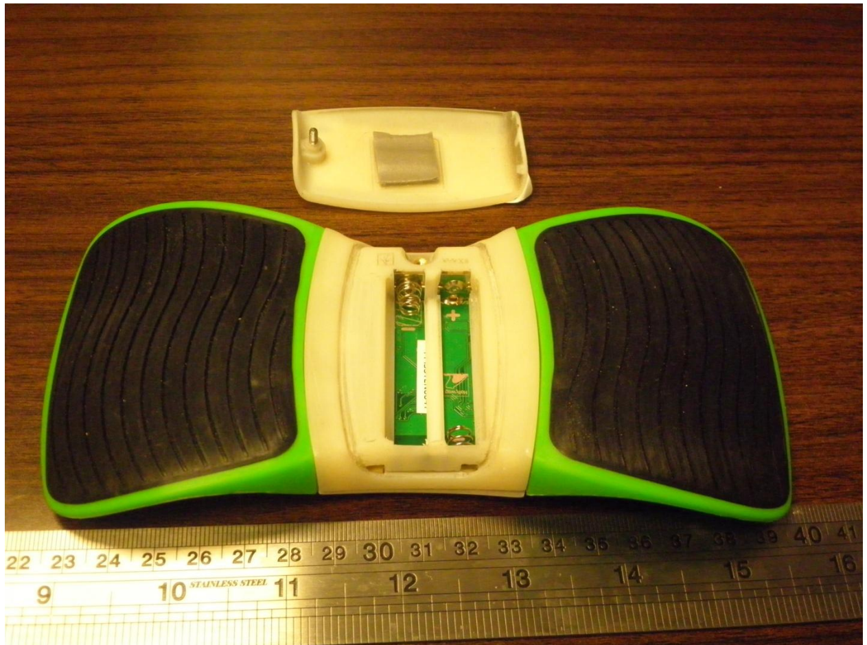
Back side: Battery cover removed