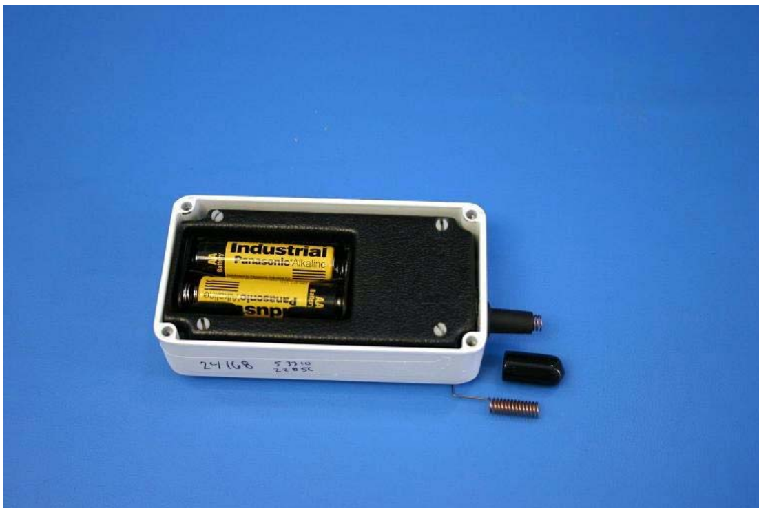
Figure 4: Eight Channel Transmitter Highlighting Spring Antenna