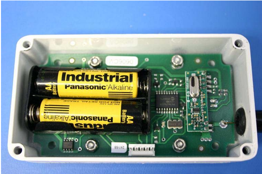
Figure 6: Top / Component Side of PCB & Circuitry