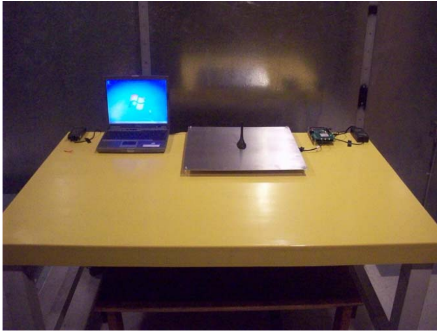
LINE CONDUCTED EMISSION (FRONT)