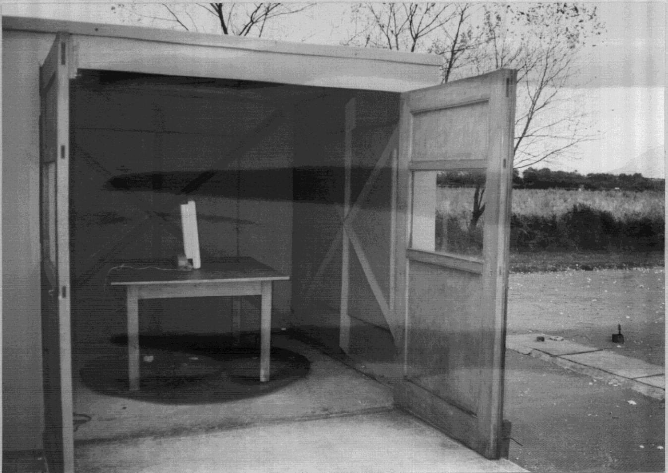
Photograph No: Annex A-1 Title: Test Site with Rx