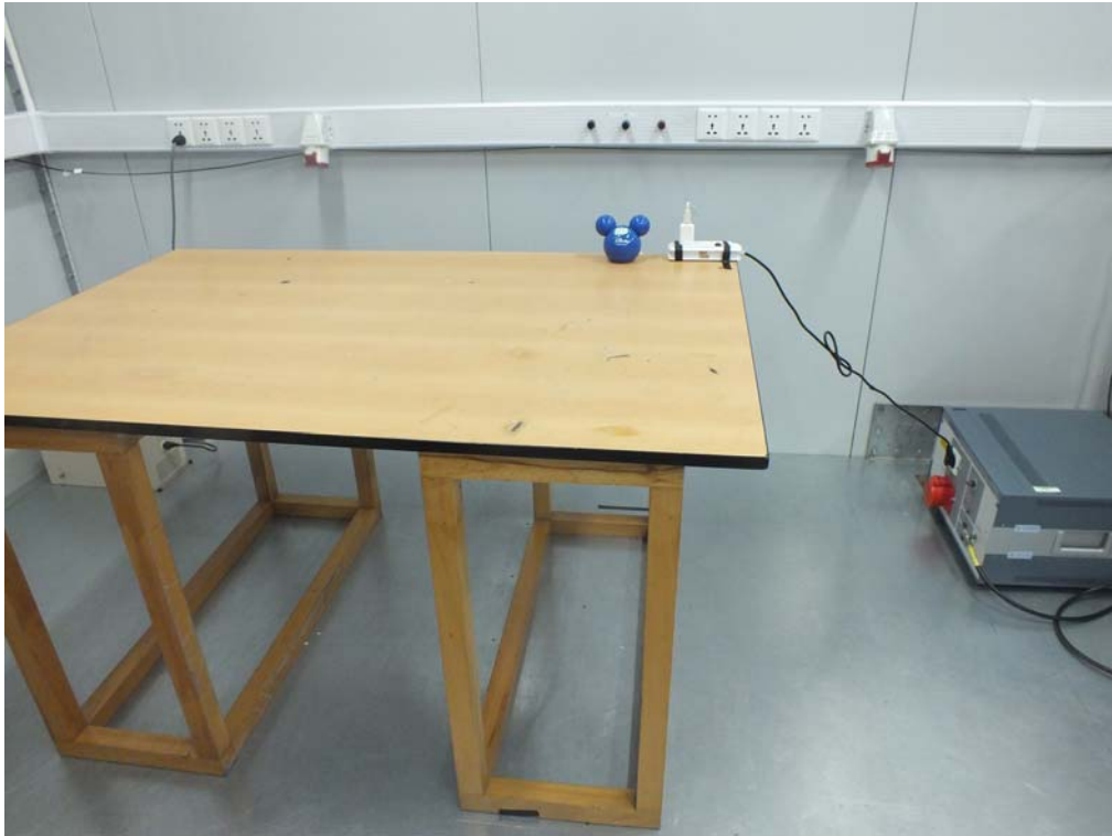
Test Setup Photo Conducted Emission