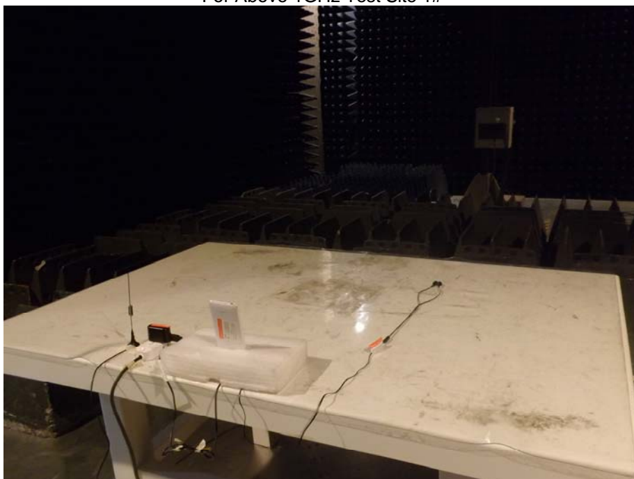
For Above 1GHz Test Site 1#