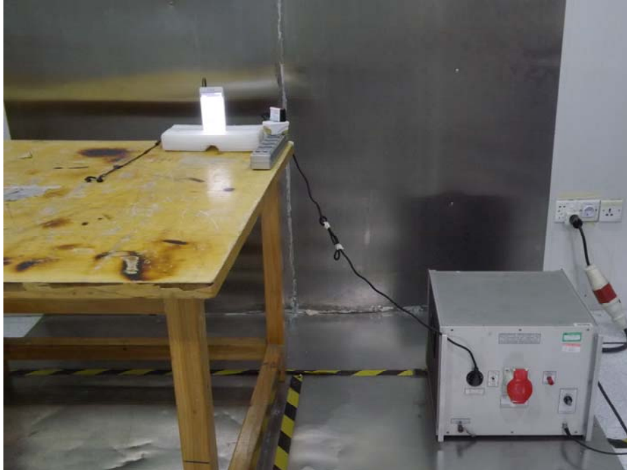
Test Site 1#