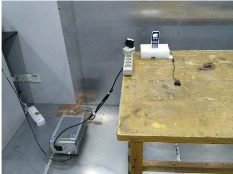
Test Site 1#