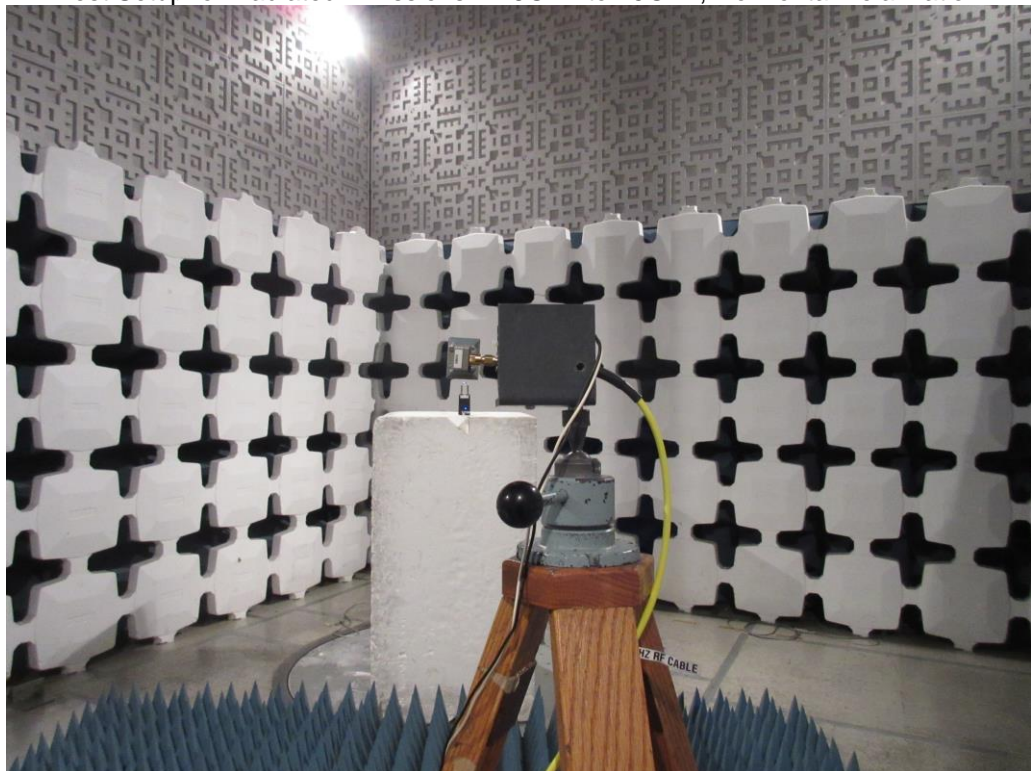
Test Setup for Radiated Emissions – 18GHz to 25GHz, Vertical Polarization