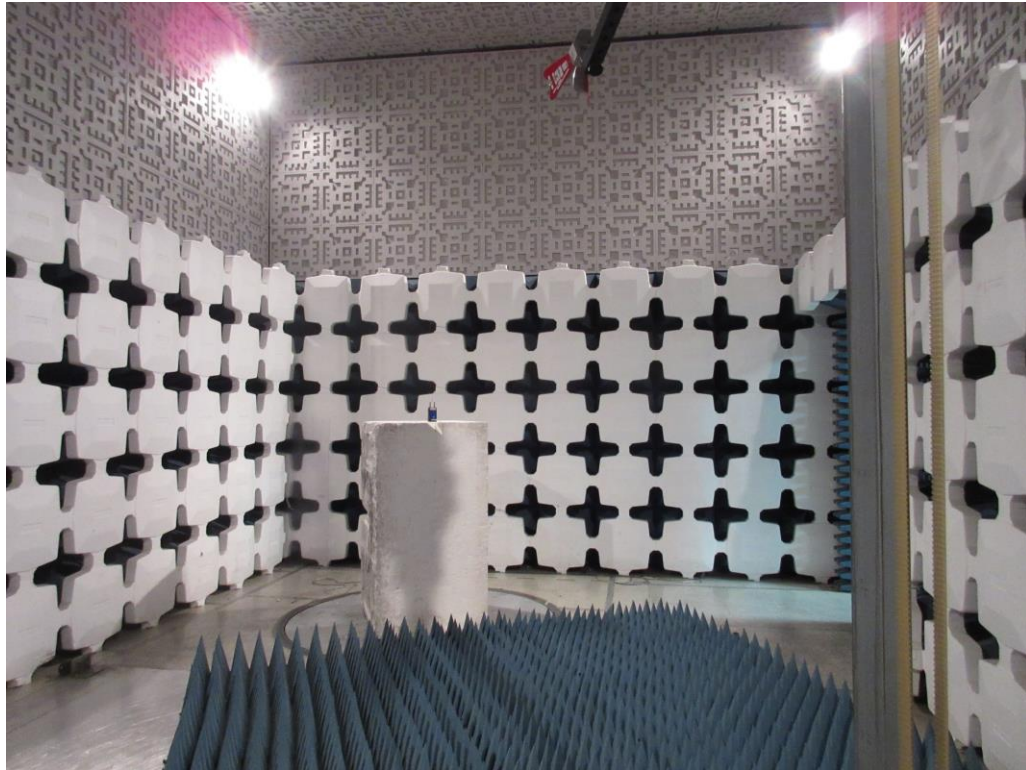
Test Setup for Radiated Emissions – 1GHz to 18GHz, Horizontal Polarization