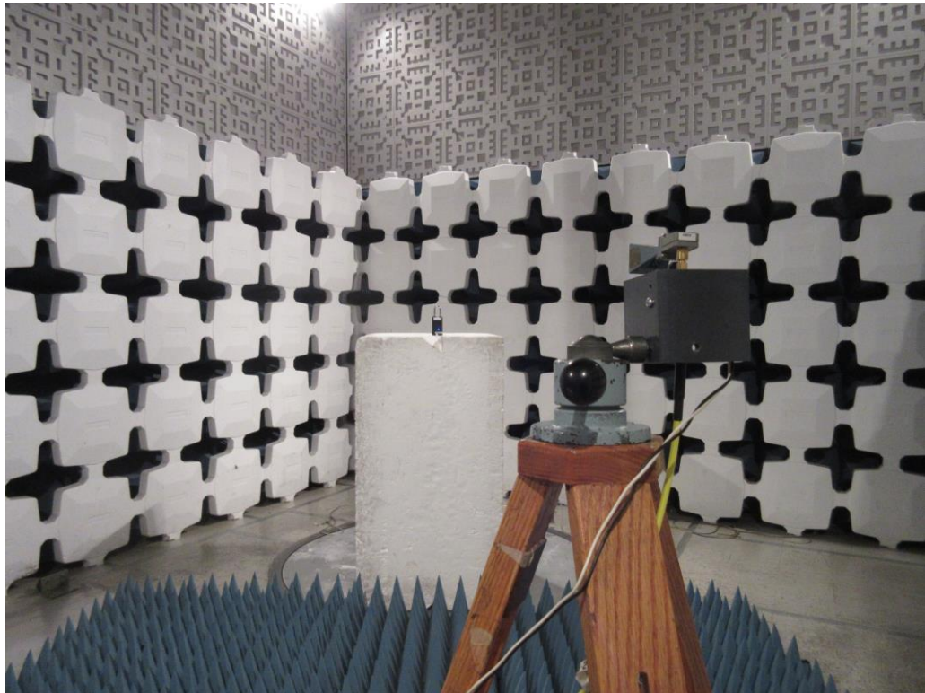
Test Setup for Radiated Emissions – 18GHz to 25GHz, Horizontal Polarization