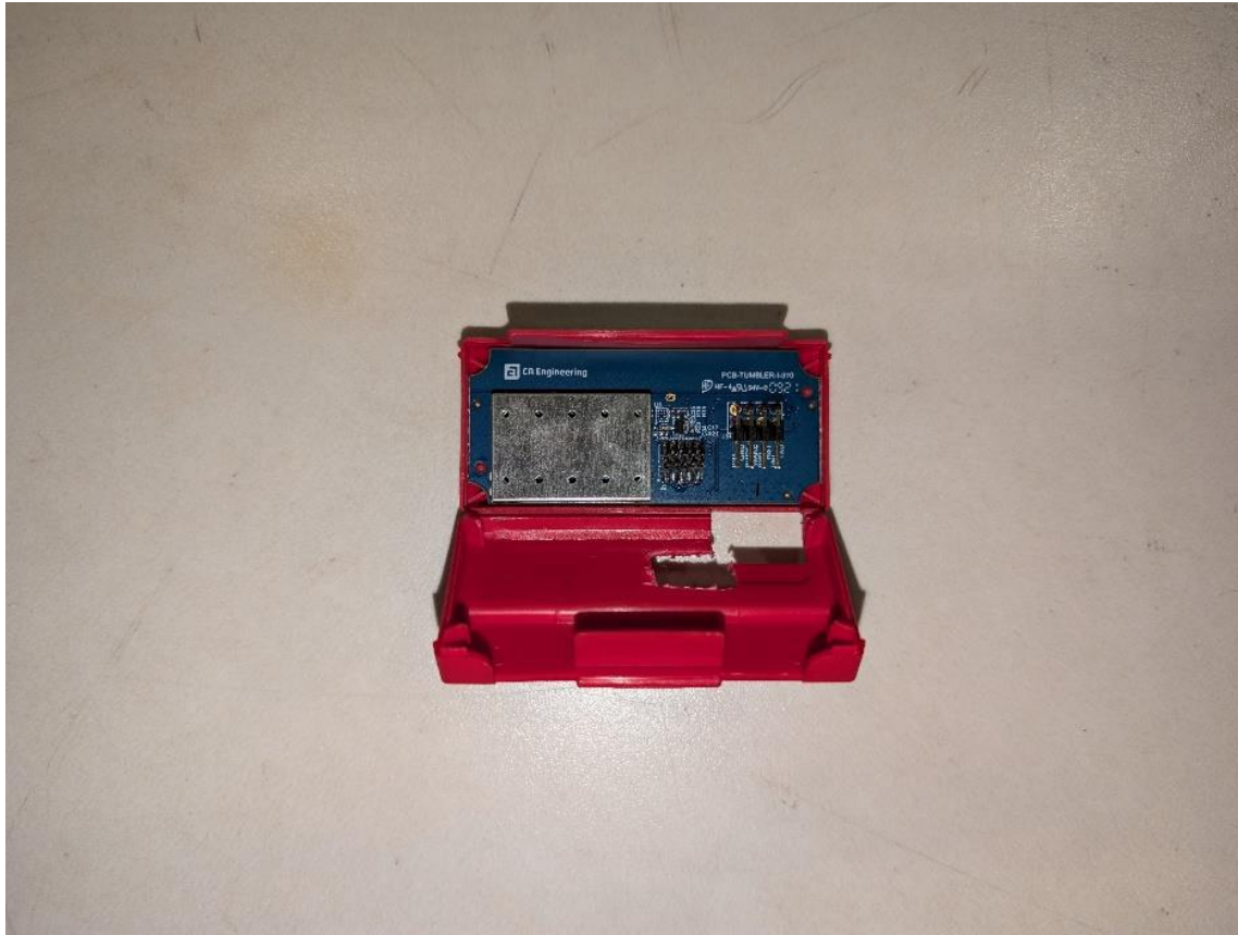
Photograph 4 – View of the PCB Mounting in the Enclosure