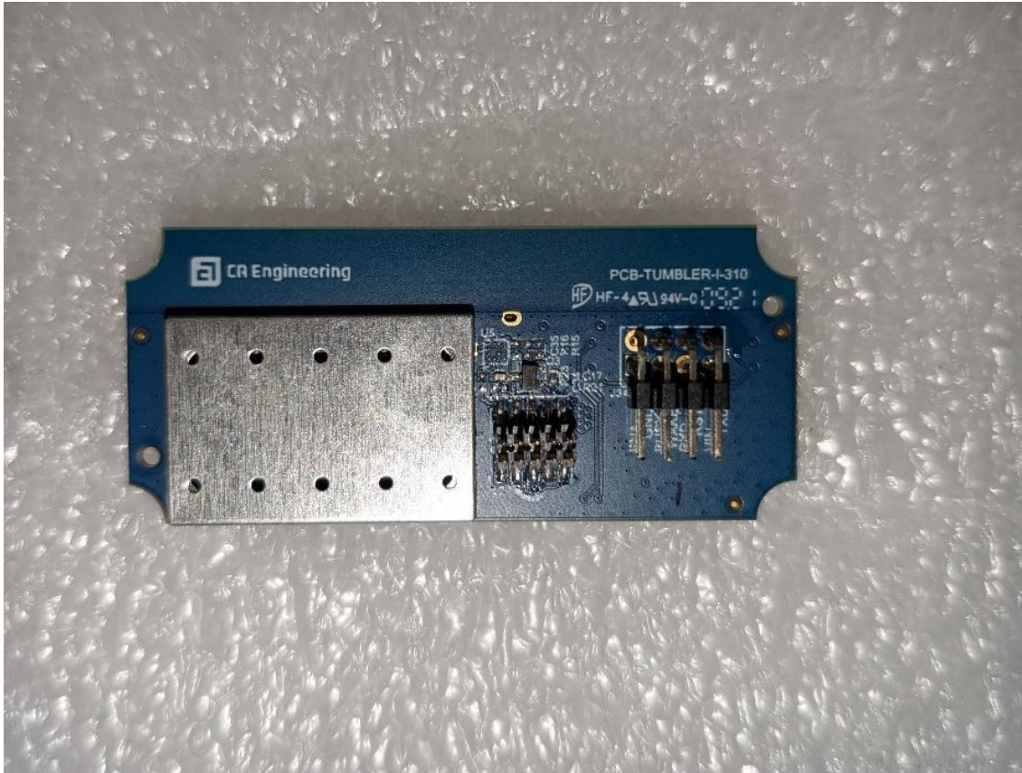
Photograph 2 – Back View of the PCBA