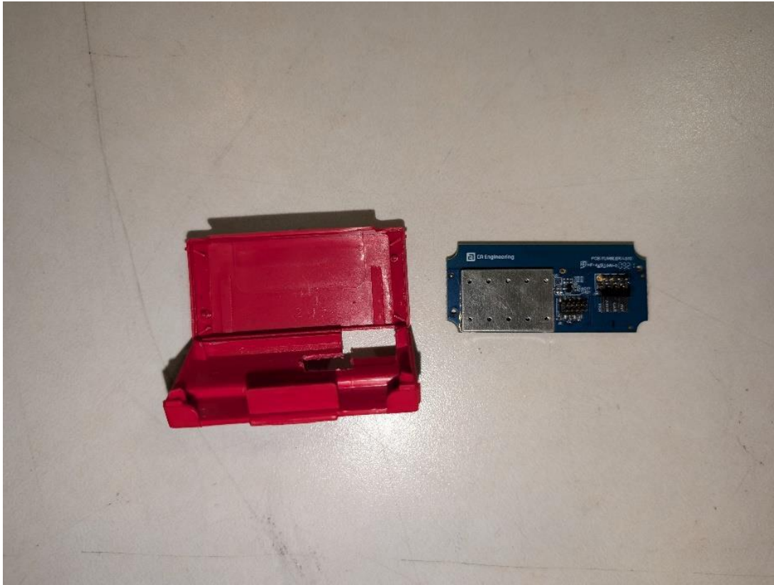
Photograph 5 – View of the PCB in relation to housing