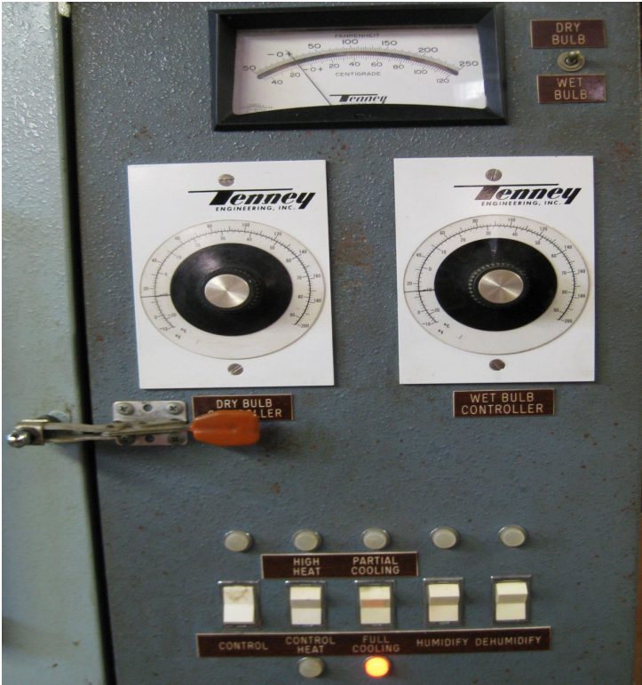
Photo 2 - Controls on Tenney Enviromental Chamber