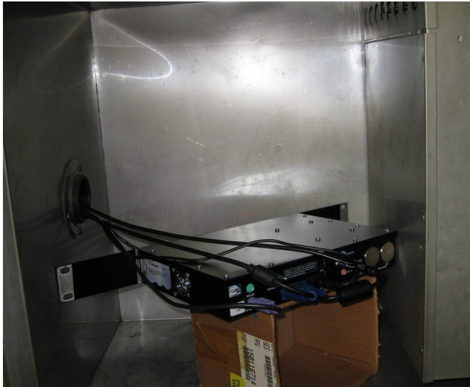
Photo 3 - CAP-DEC 1 placement inside Tenney Environmental chamber