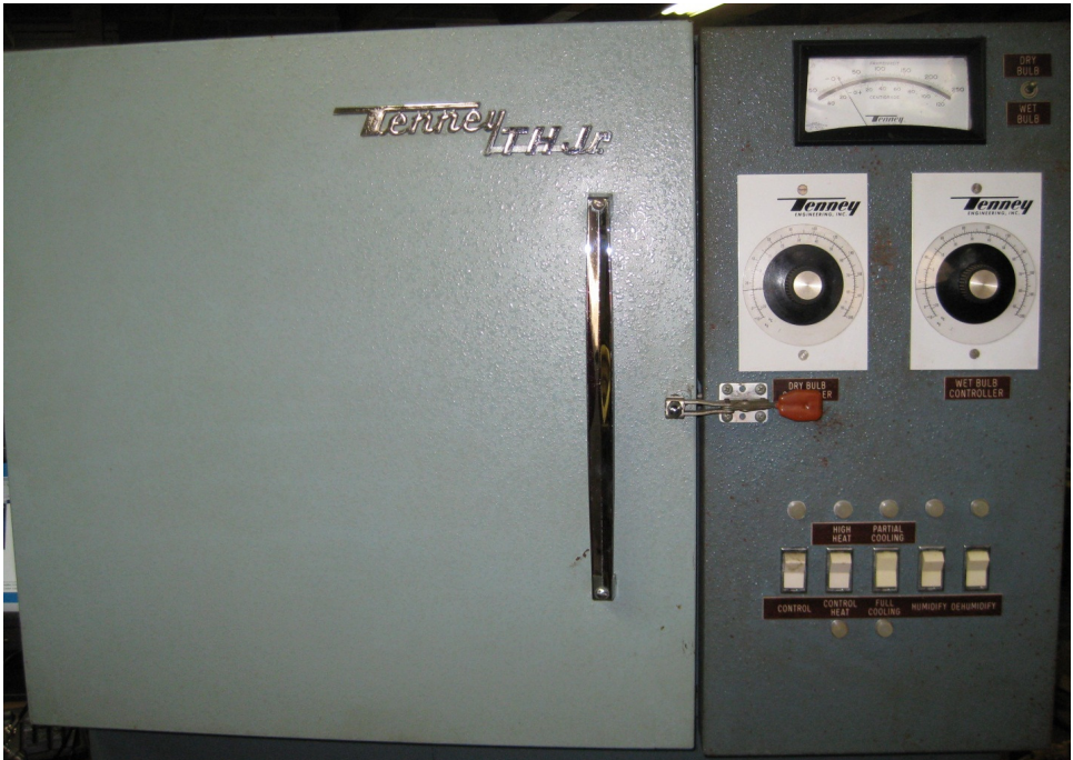
Photo 1 - Tenney Environmental Chamber