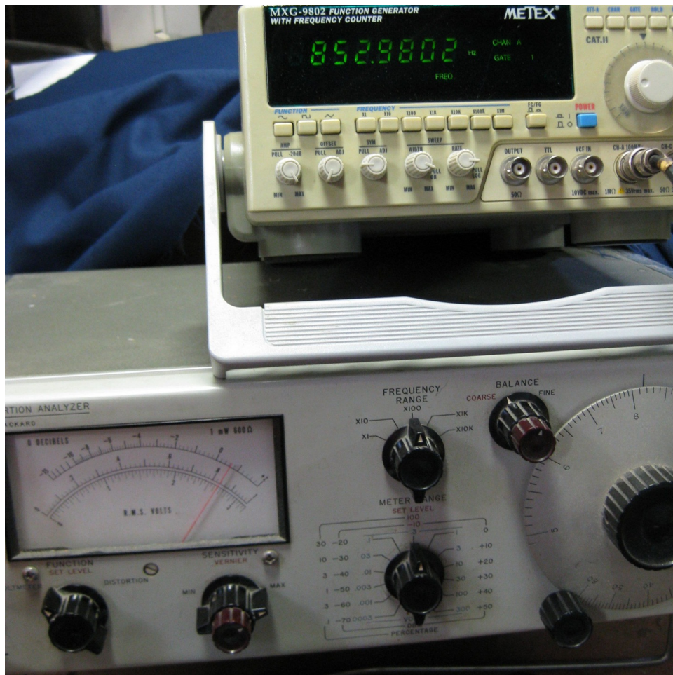
Photo 5 - Taking reading of CAP-DEC 1 showing reading on meter