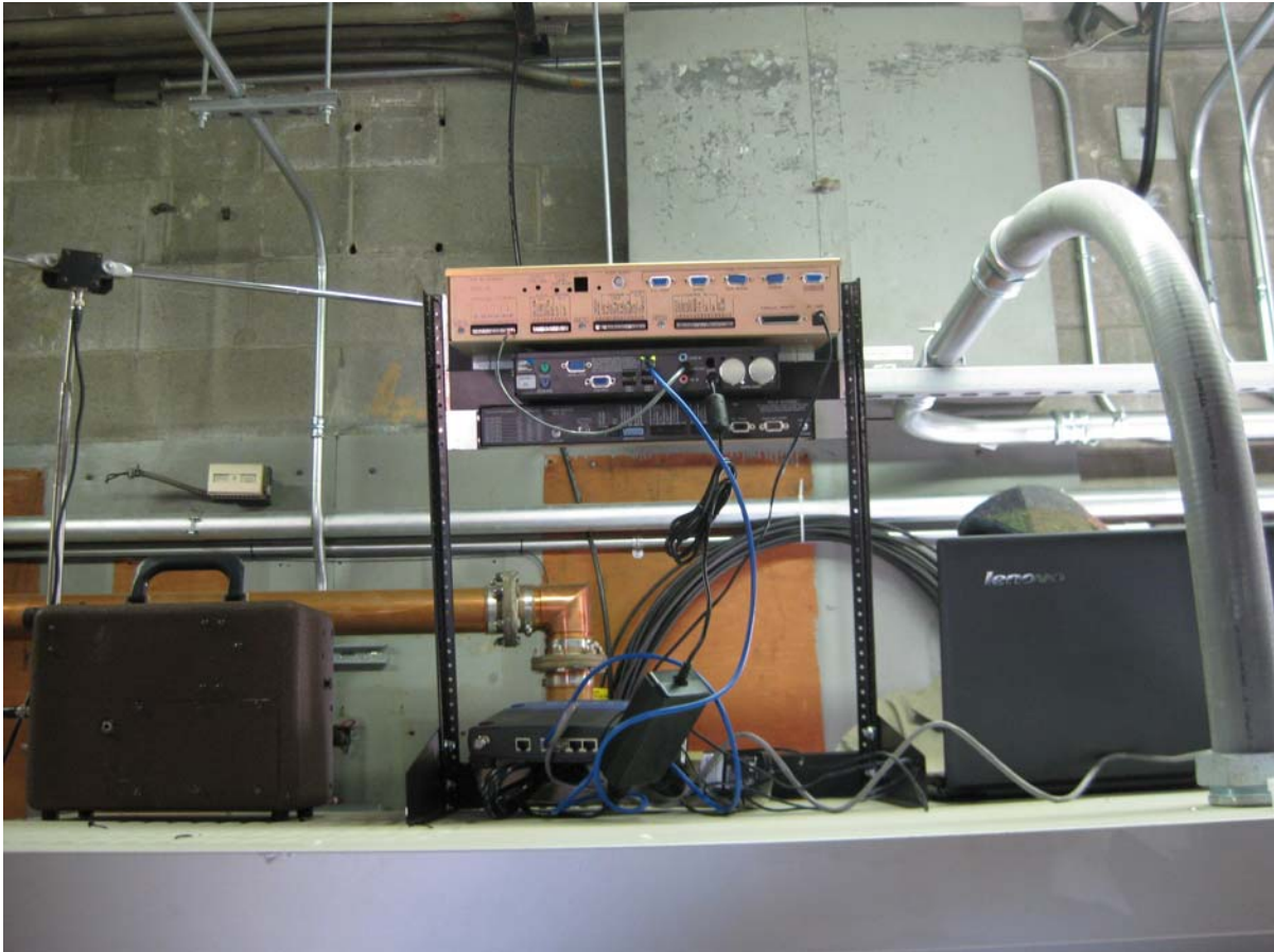
FM Test – FM Field Meter on Left (Rear View)