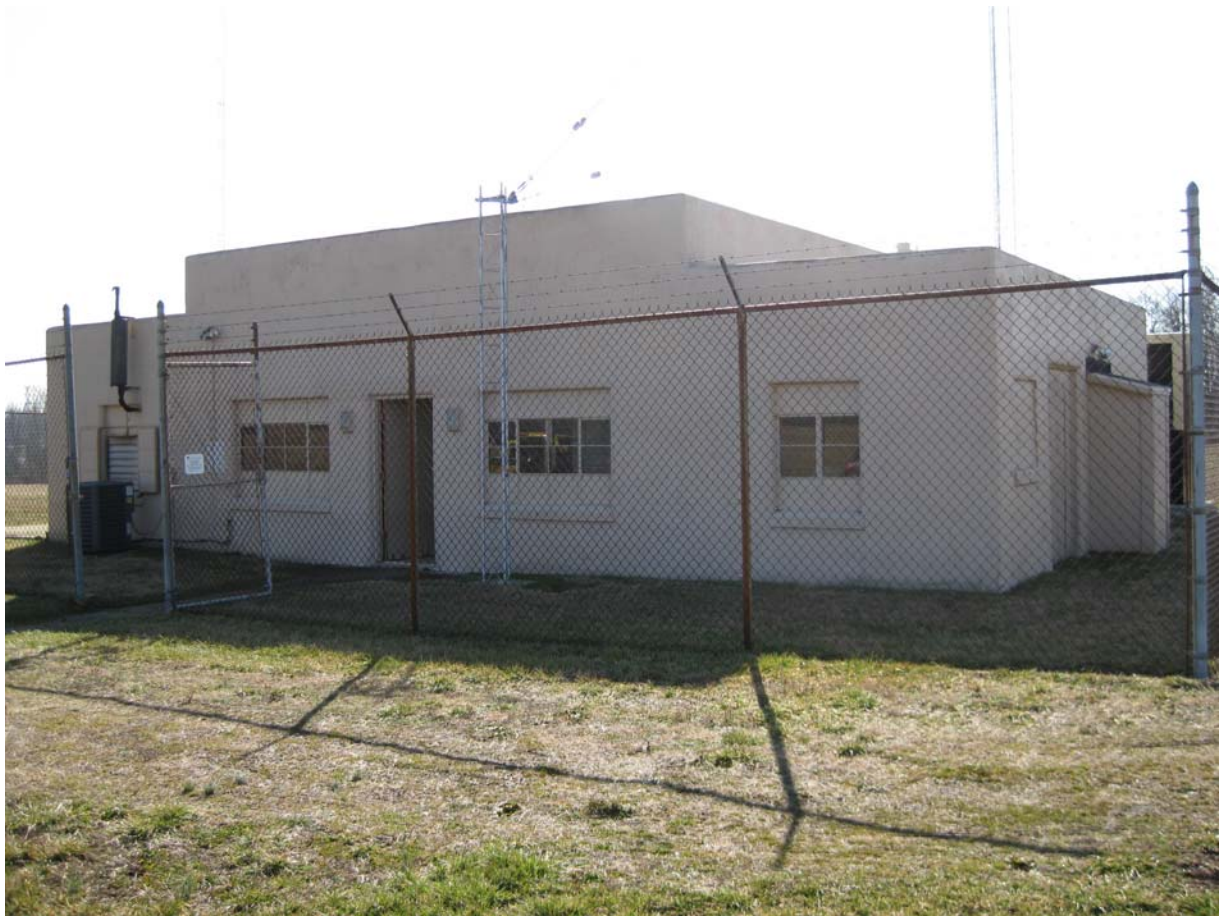
Outside view – AM & FM Transmitter site