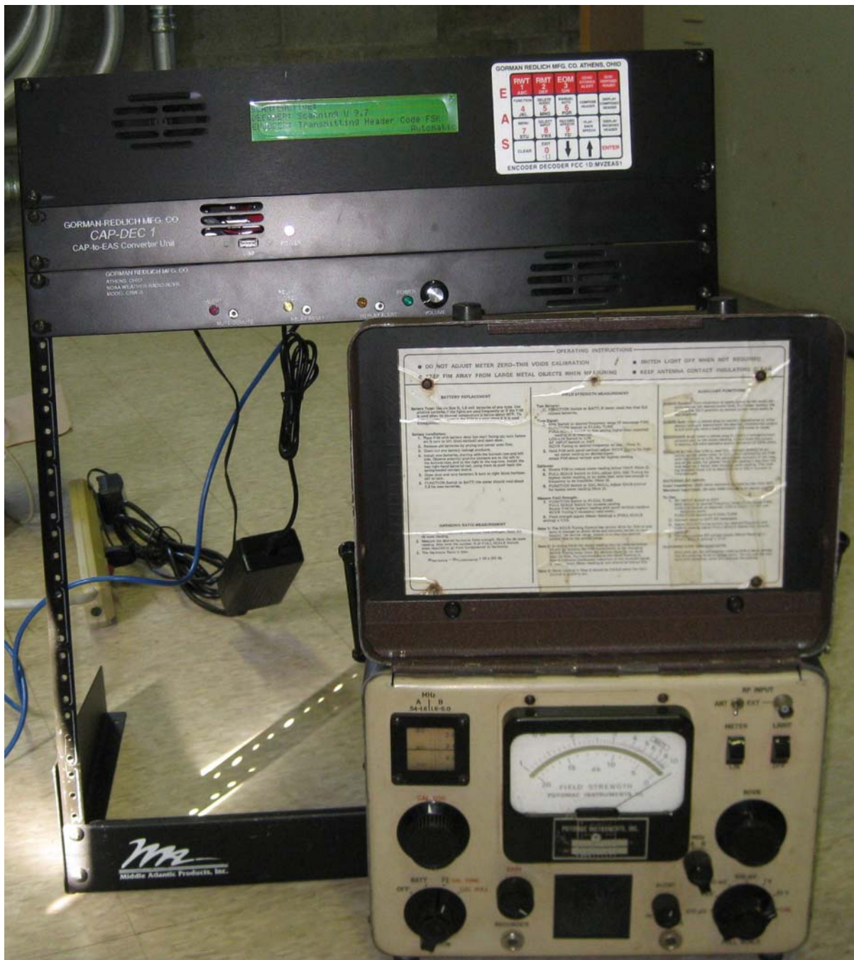
AM Test – RF Field excess of 10 V/m