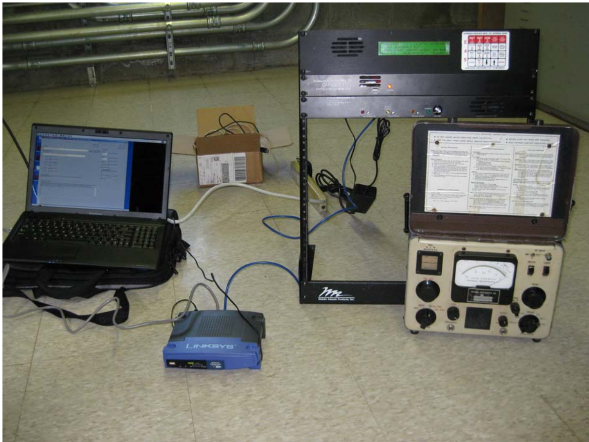
AM Test – AM Field Meter on Right (showing excess of 10 V/m)