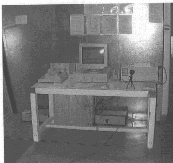
Conducted front view