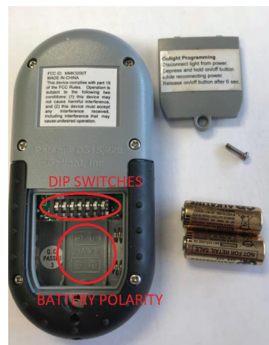
Figure 4 – Wireless Dash Remote