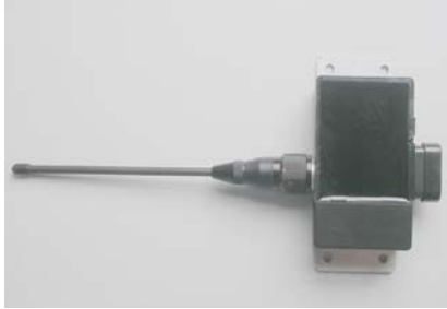
1: Main unit