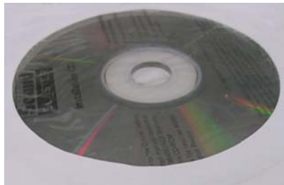
4: software disk