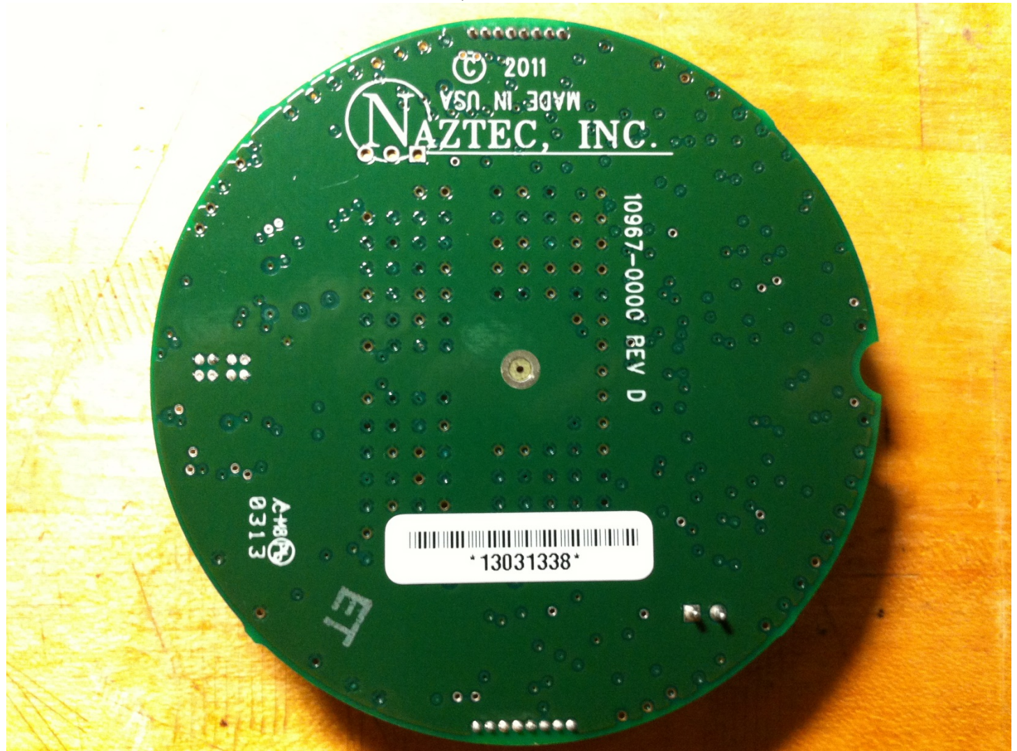
Disassembled View, Bottom Side of Circuit Board

The dark circular ferrite pad is removed in this view.