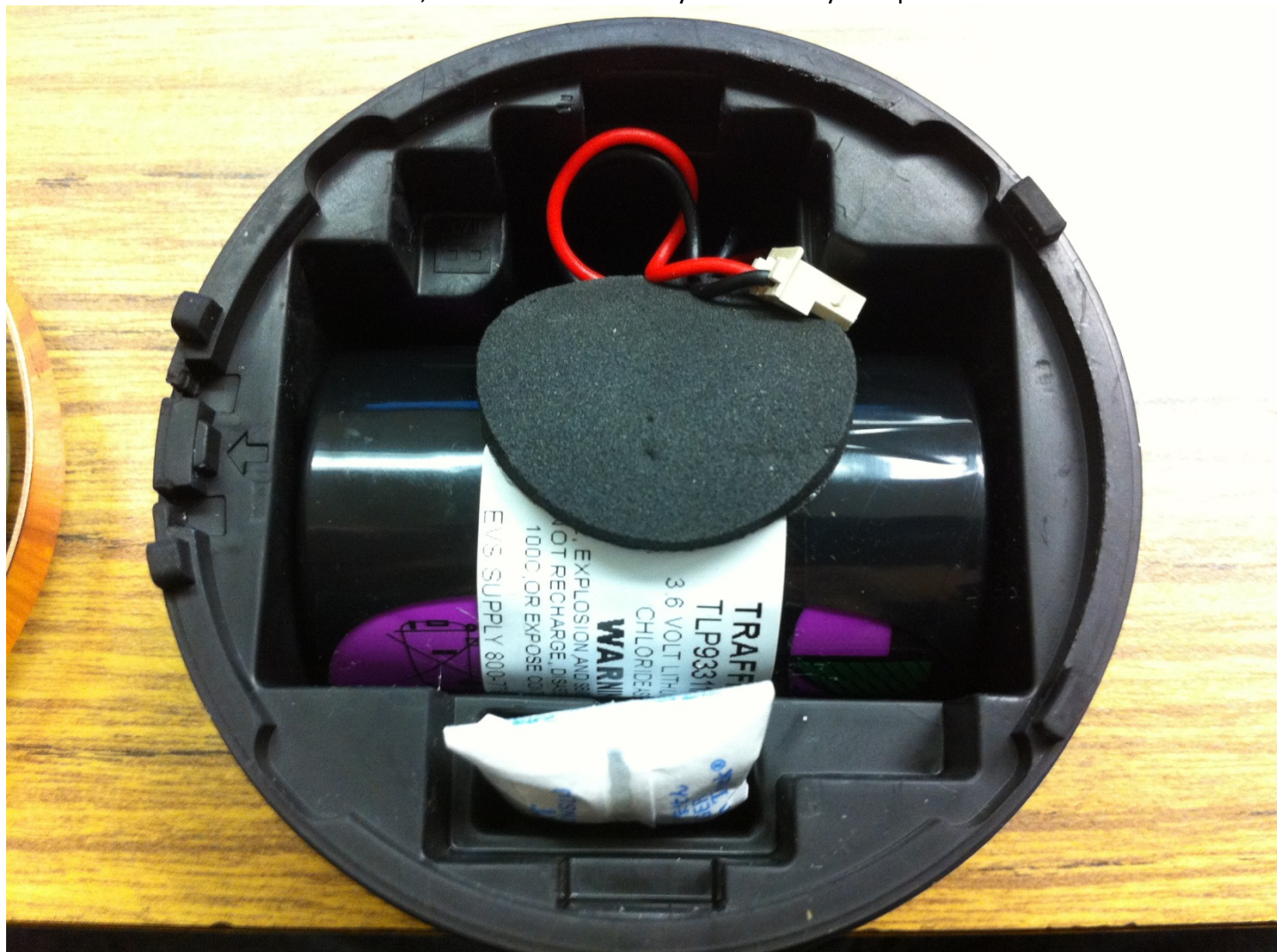
Disassembled View, Internal Sub-assembly with Battery Compartment Visible

The battery compartment is shown, this assembly holds the antenna and circuit board in place. The feed point of the antenna is located to the left where the arrow points..