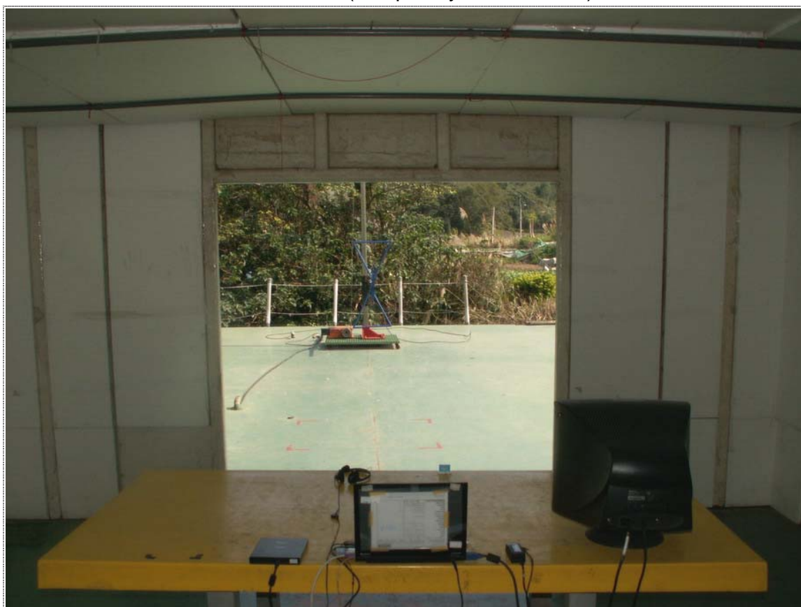
Rear View (Frequency under 1GHz)