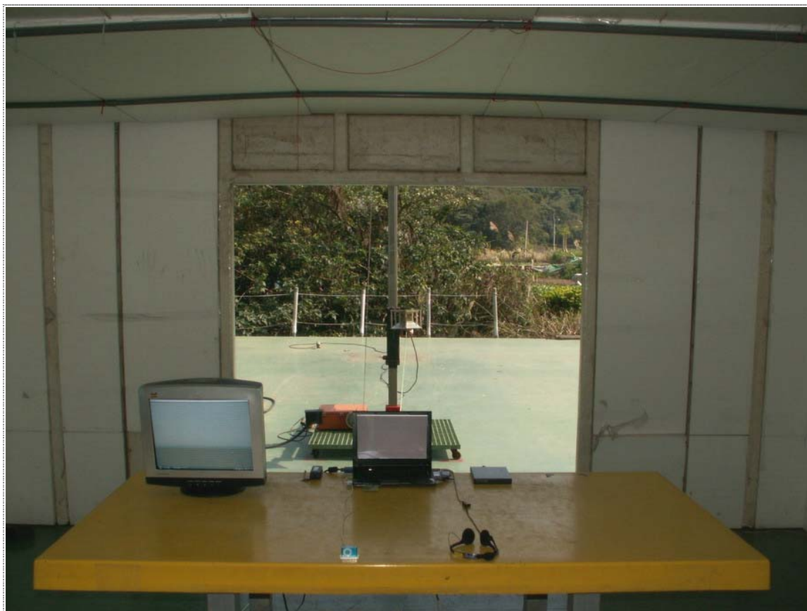
Front View (Frequency above 1GHz)