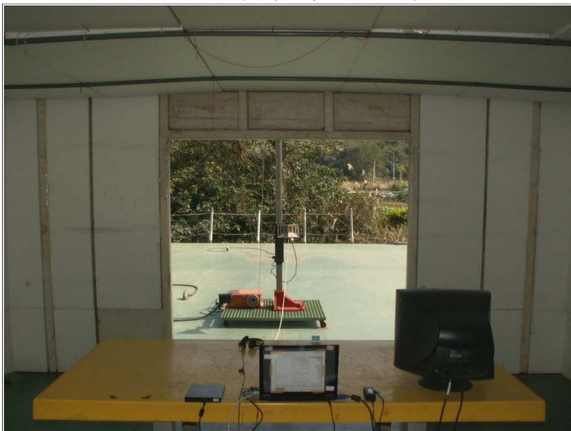
Rear View (Frequency above 1GHz)