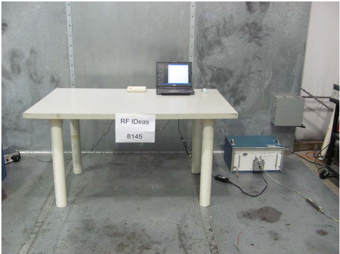
Photograph of Conducted Emissions Test Setup