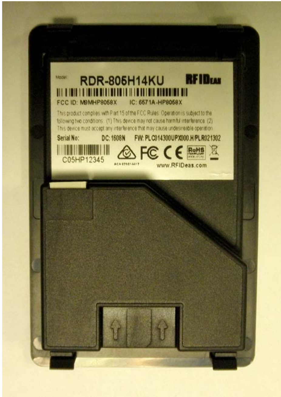
Serial Number label installed on the bottom of EUT