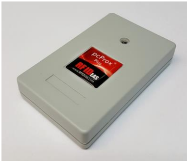
Wave ID pcProx® Plus Reader