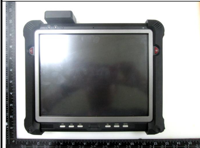
EUT with RFID – Front View