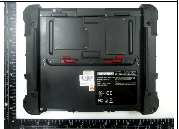
EUT – Rear View