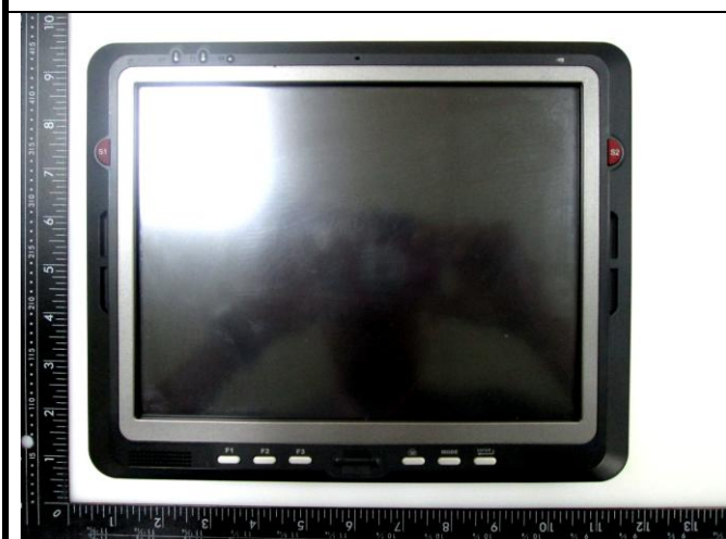
EUT Remove Bumper – Front View