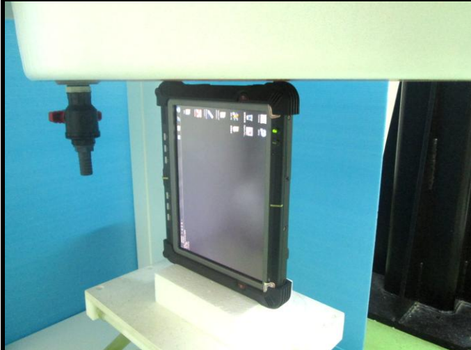
Left Side of EUT with 0 cm Gap