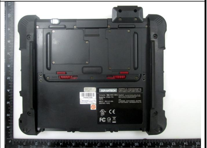
EUT with RFID – Rear View