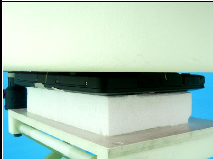
Rear Face of EUT (Removed Bumper) with 0 cm Gap