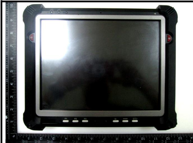
EUT – Front View