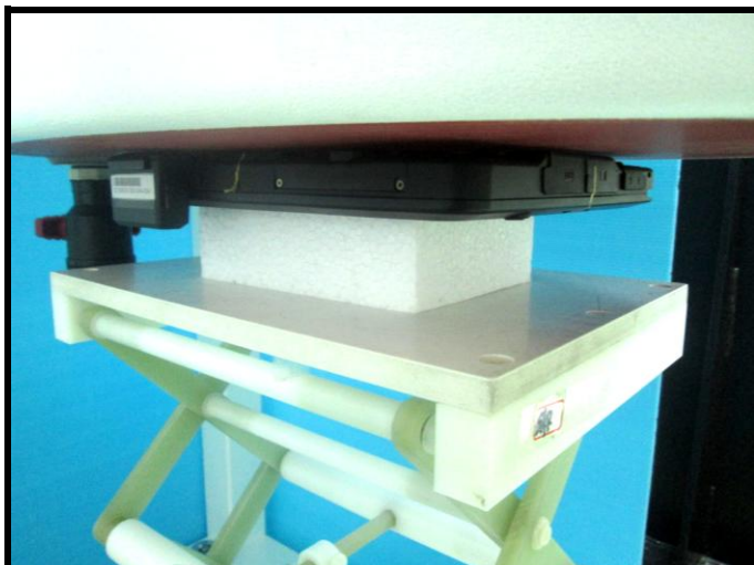
Rear Face of EUT (Removed Bumper) with 0 cm Gap (EUT with RFID Accessory)