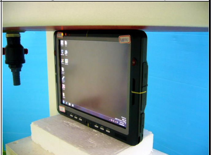
Top Side of EUT (Removed Bumper) with 0 cm Gap