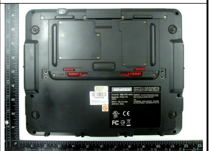
EUT Remove Bumper – Rear View