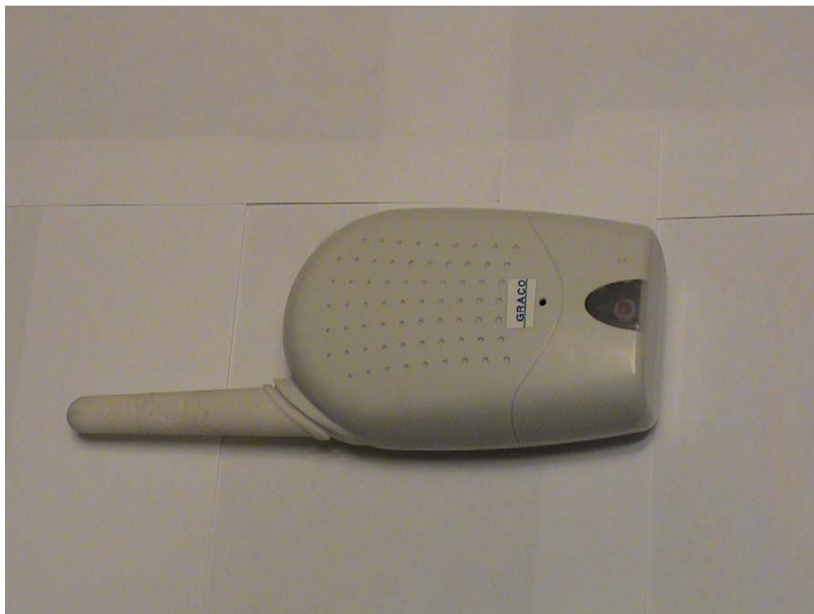
Front View of Appearance