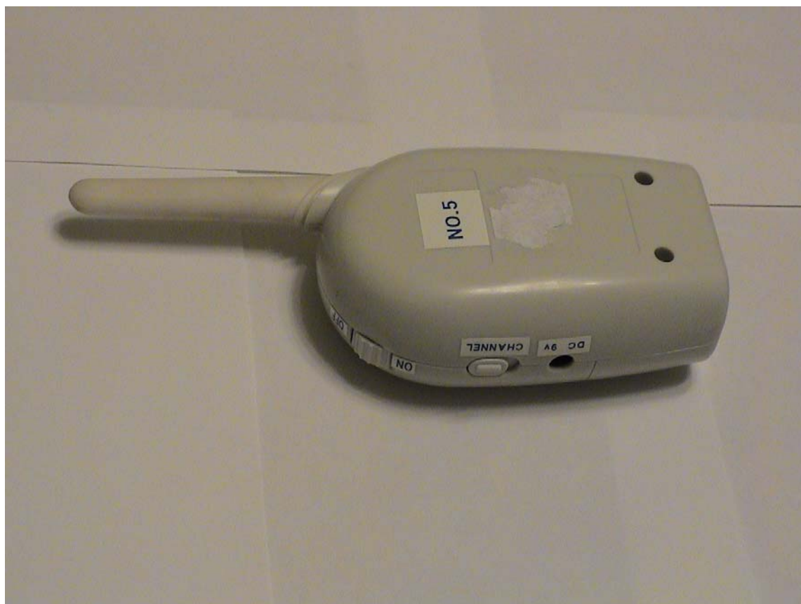
Rear View of Appearance