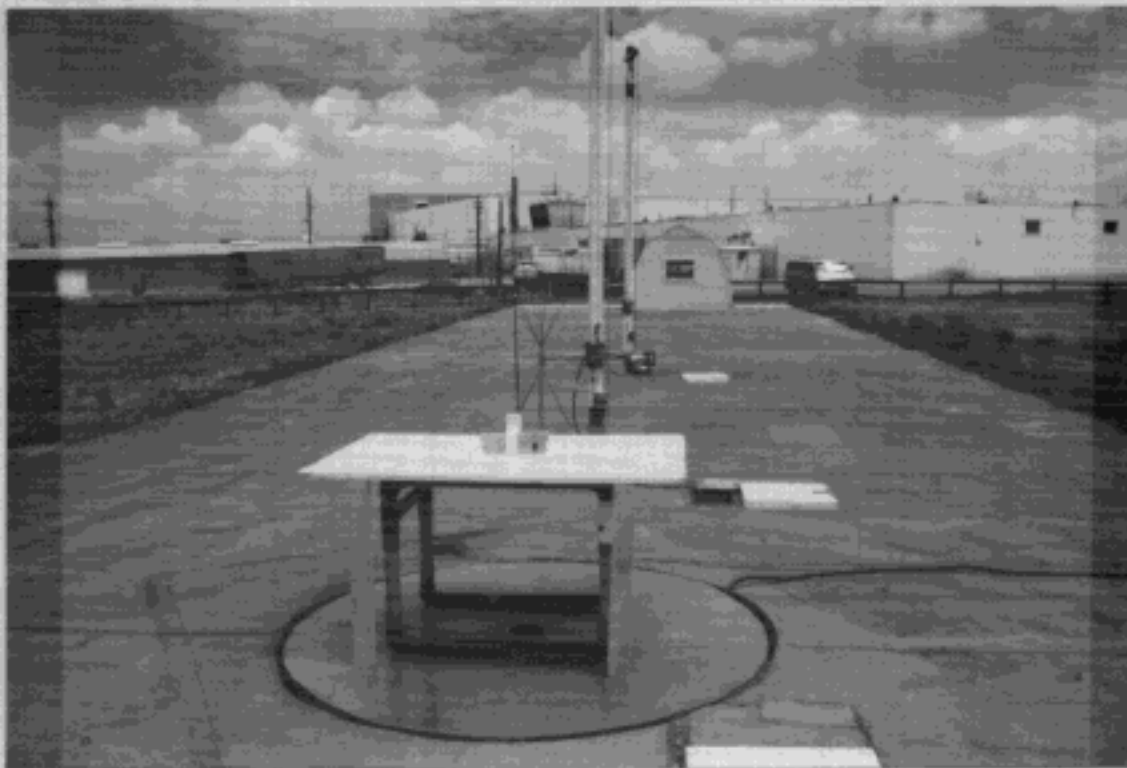
Photograph 3 Radiated Emissions - Rear View Typical 4.1.2B Setup