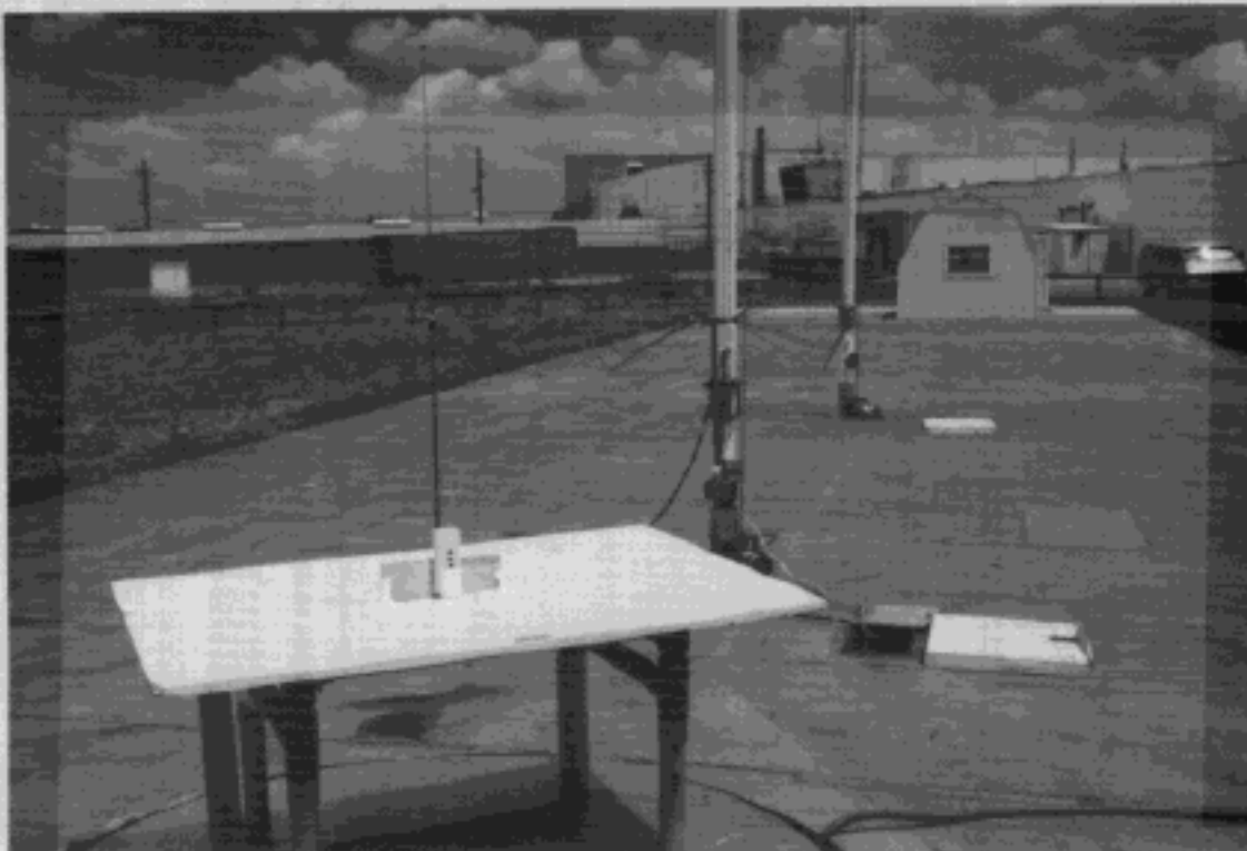
Photograph 6 4.1.2C Setup, Typical