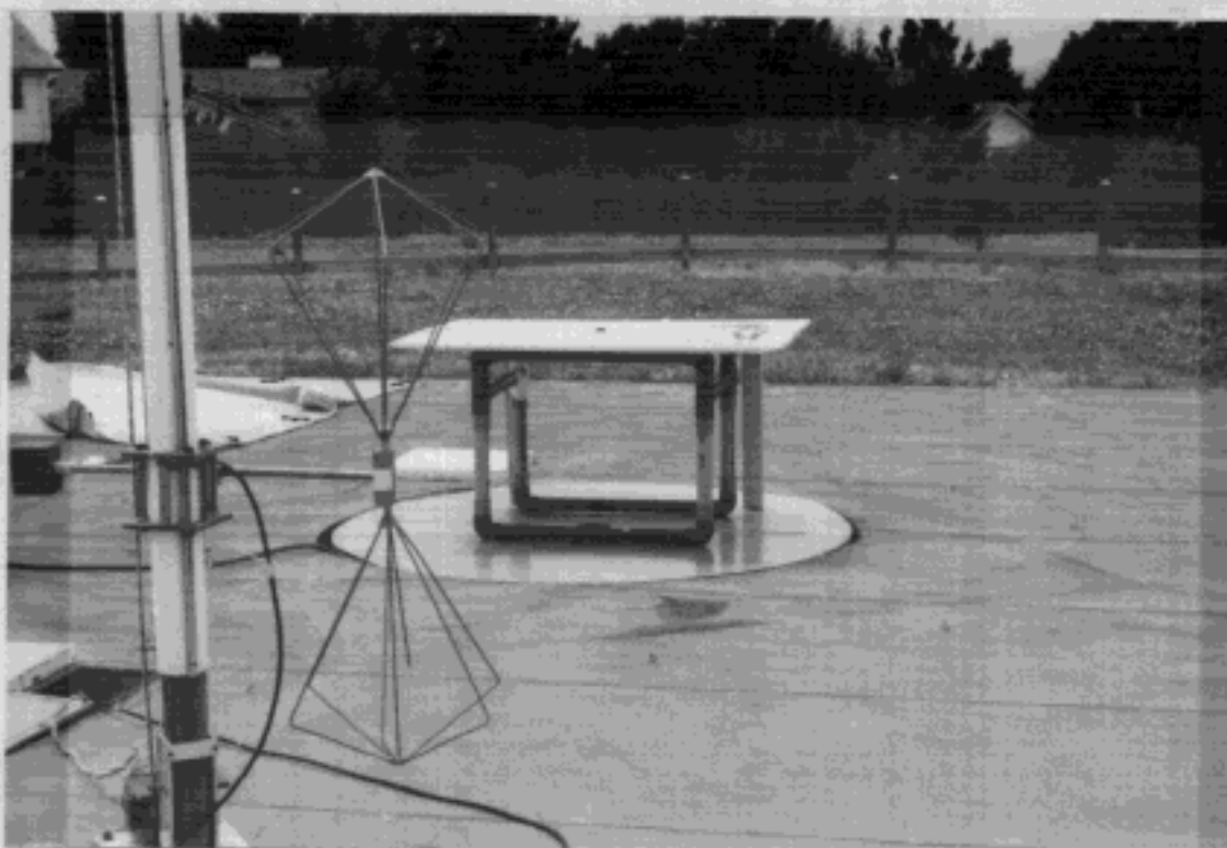
Photograph 7 4.1.2D Setup, Typical