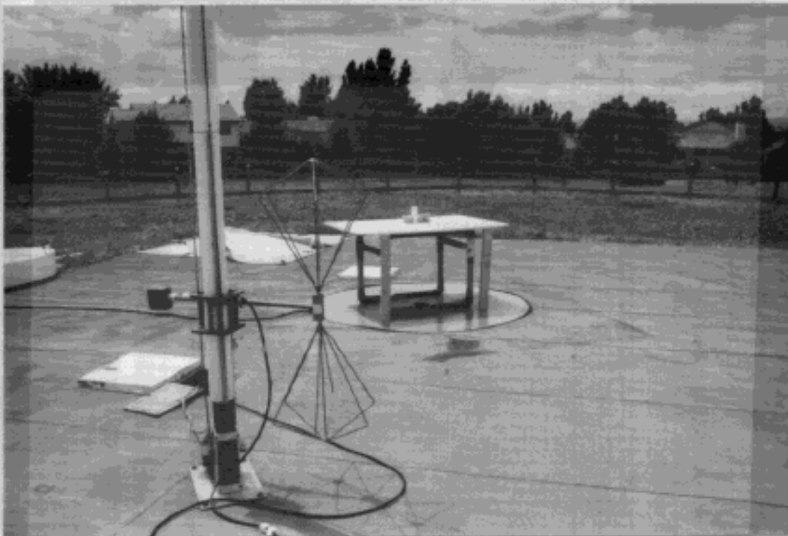
Photograph 2 Radiated Emissions Front View Typical 4.1.2B Setup