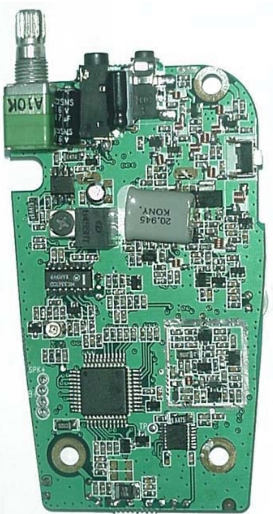
PCB – Back