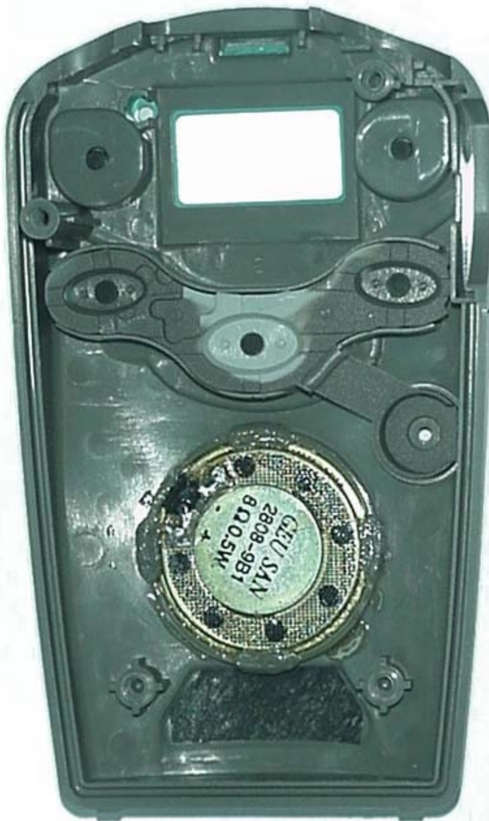
Front – Inside