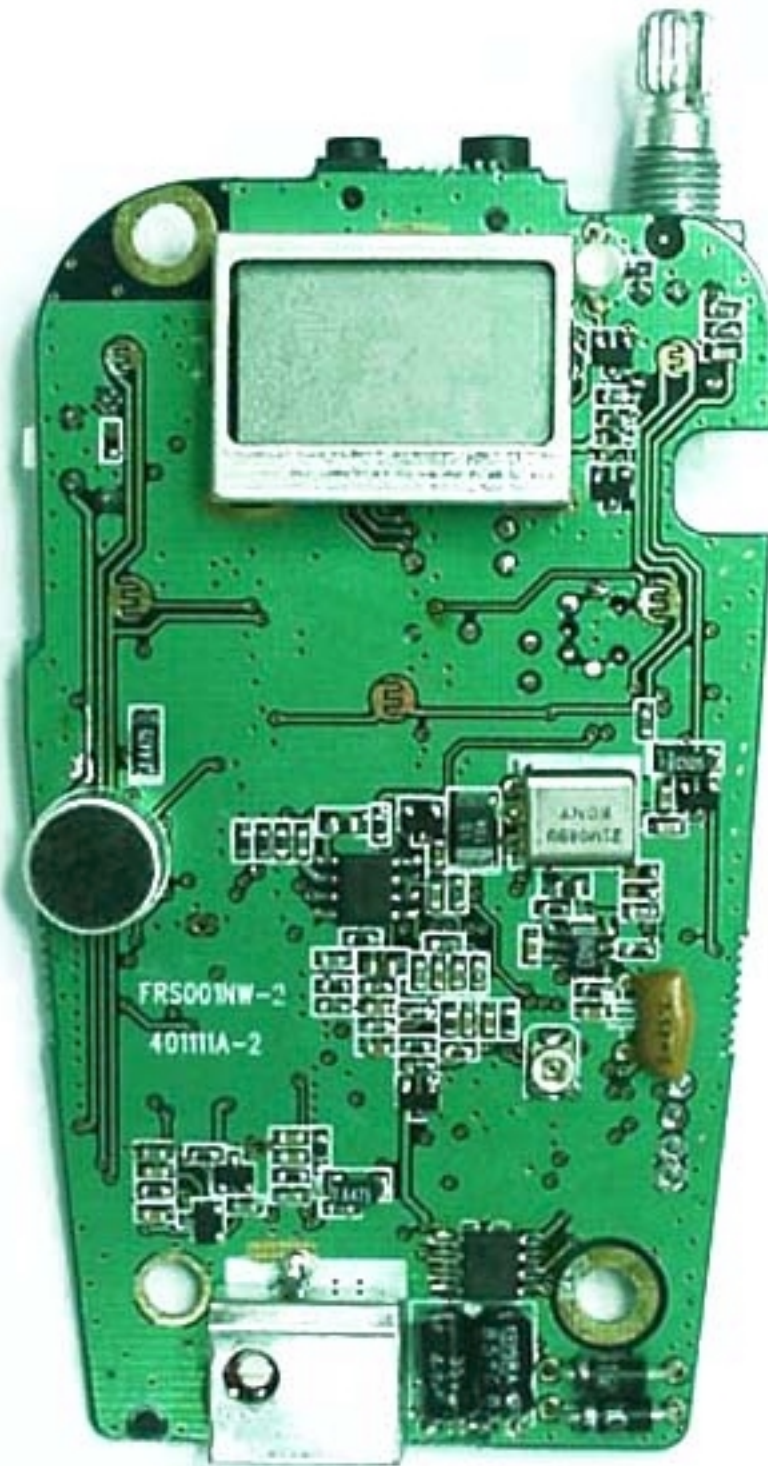
PCB – Top