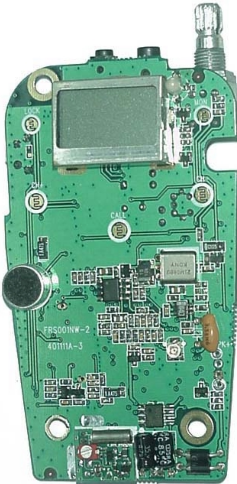
PCB – Front