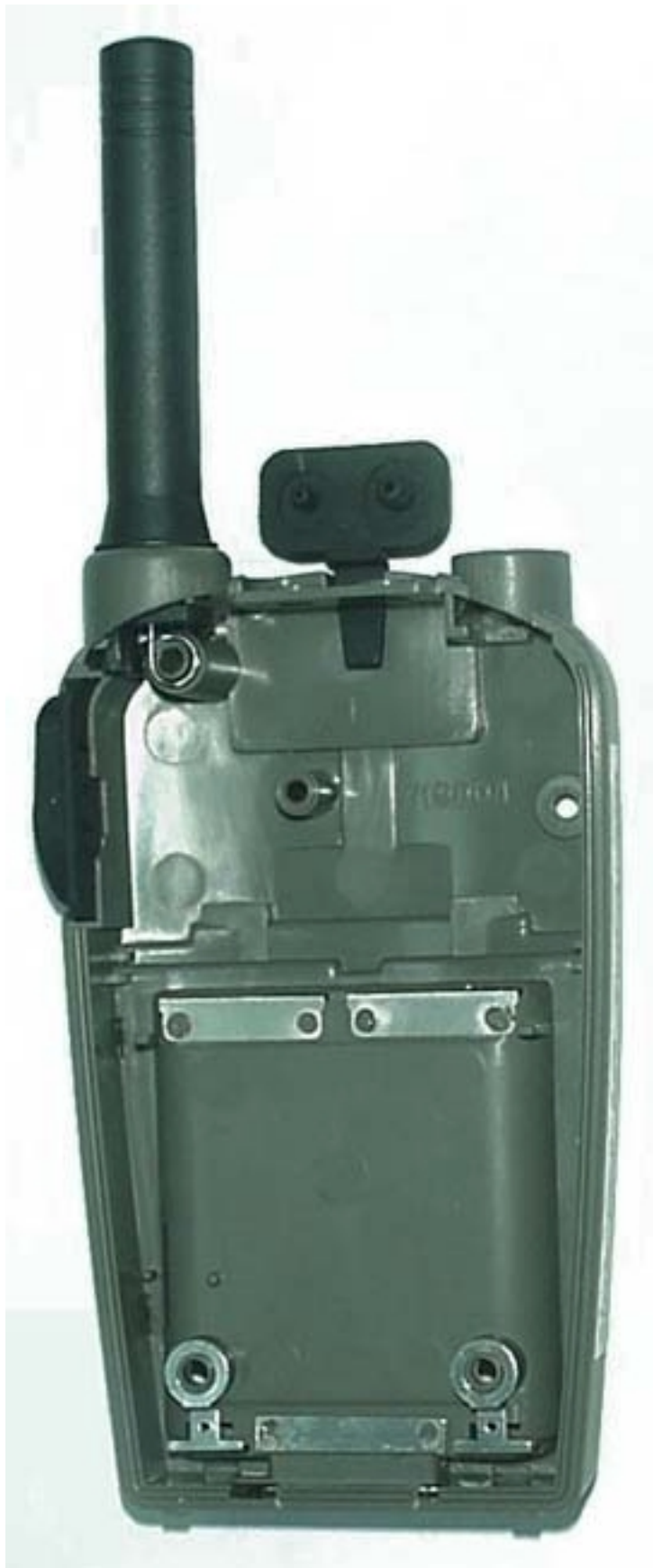
Back – Inside