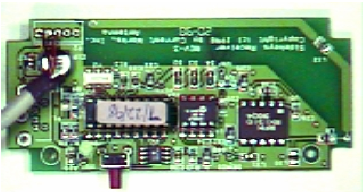
Component side of Receiver PCB