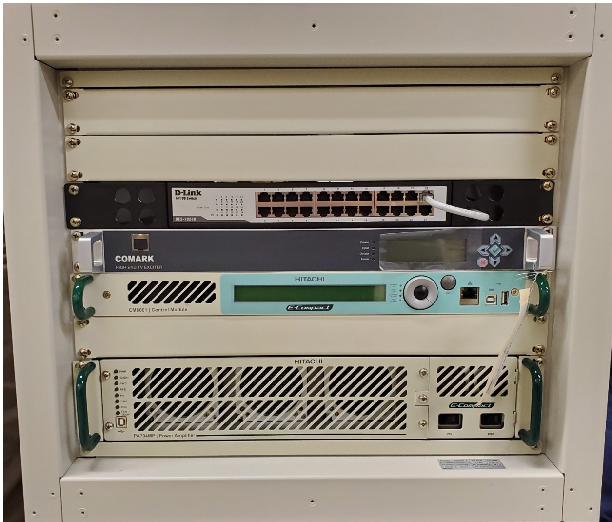
Figure 1. EC702MP Front View