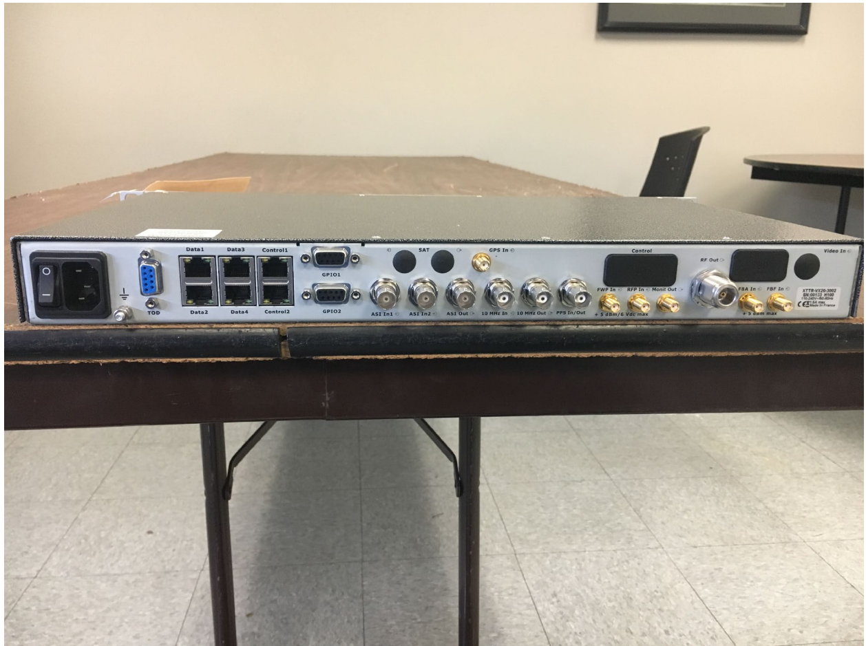
Figure 4. Exact V2 Exciter Rear View