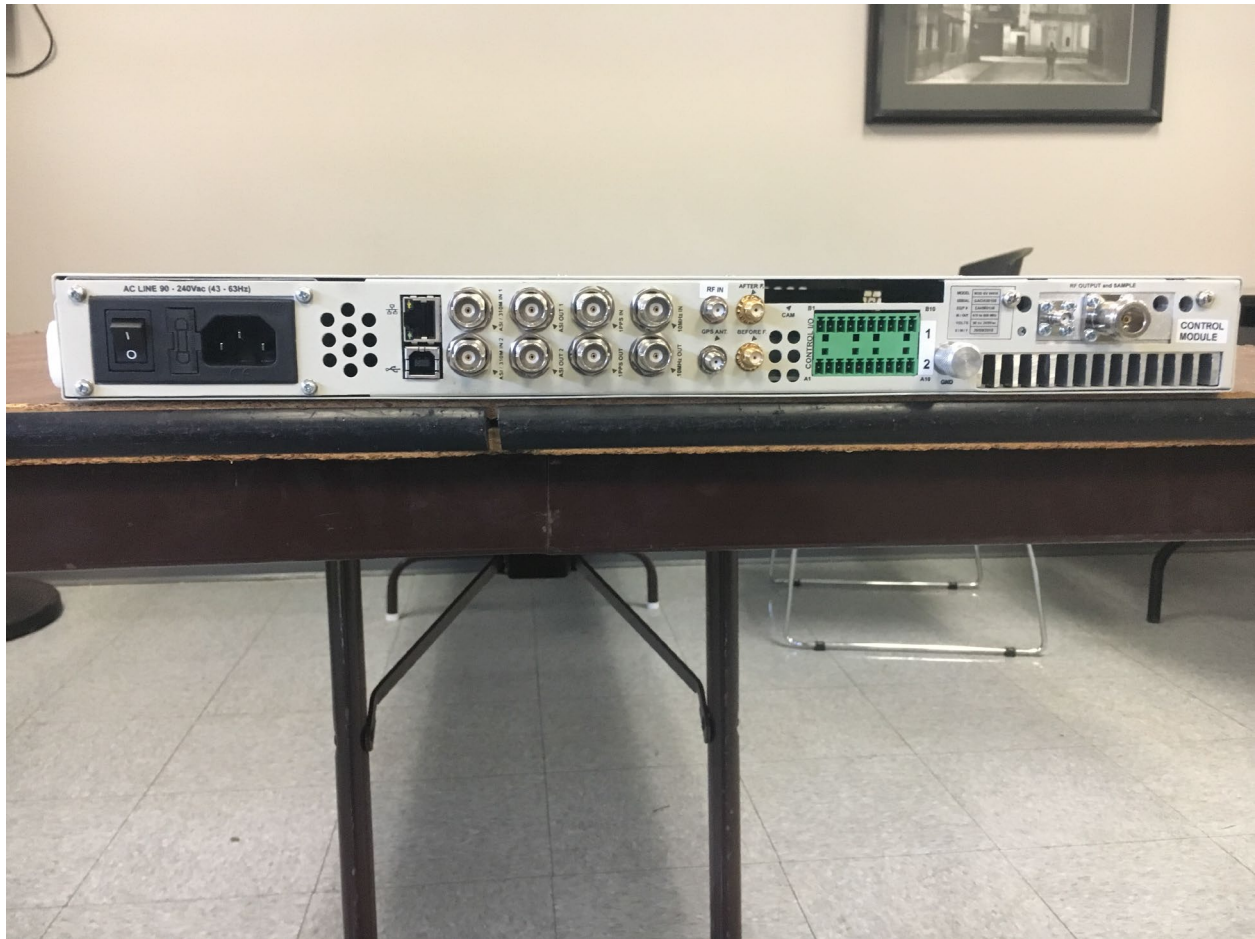
Figure 6. Transmitter Control Module Rear View