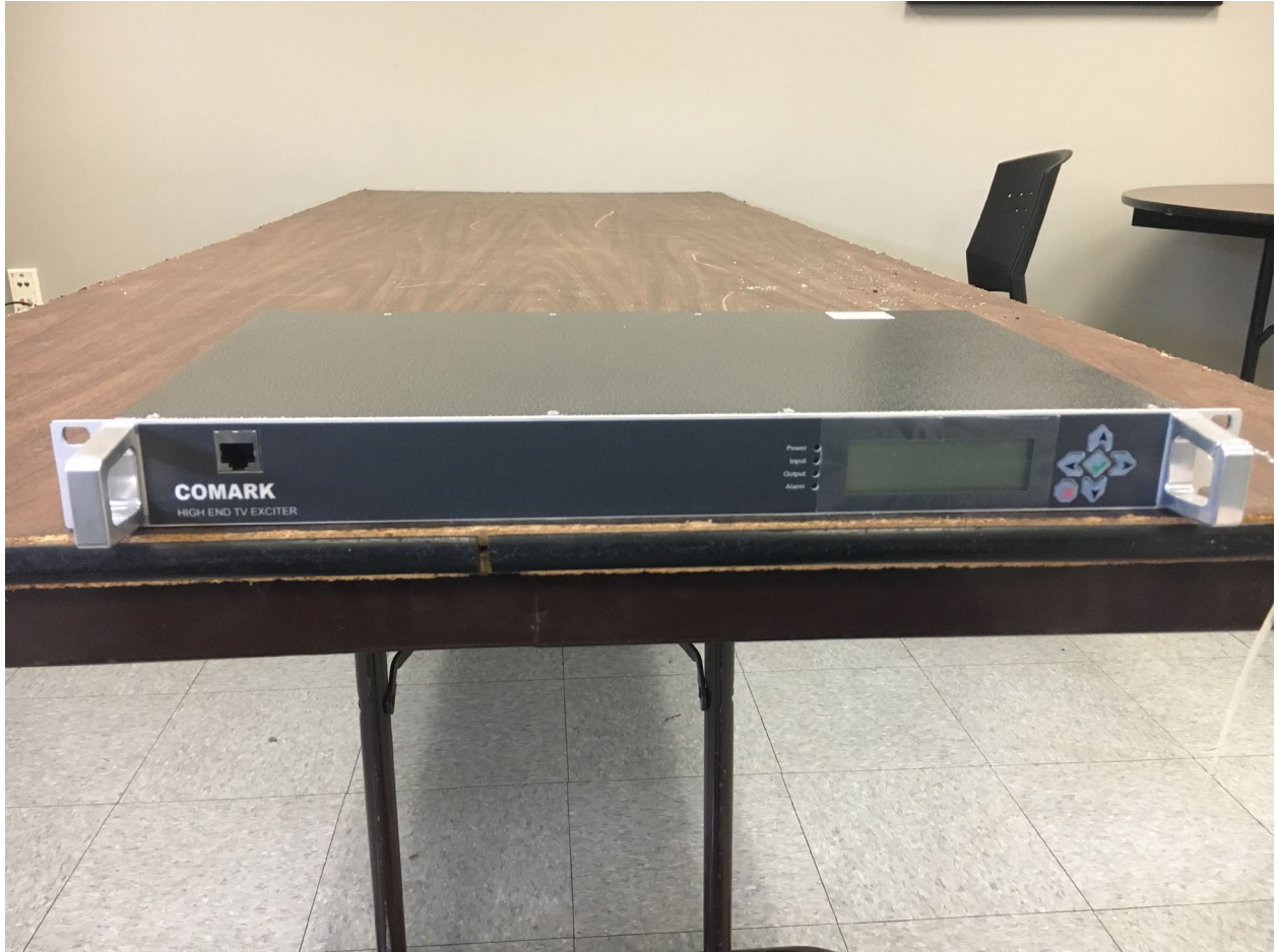
Figure 3. Exact V2 Exciter Front View