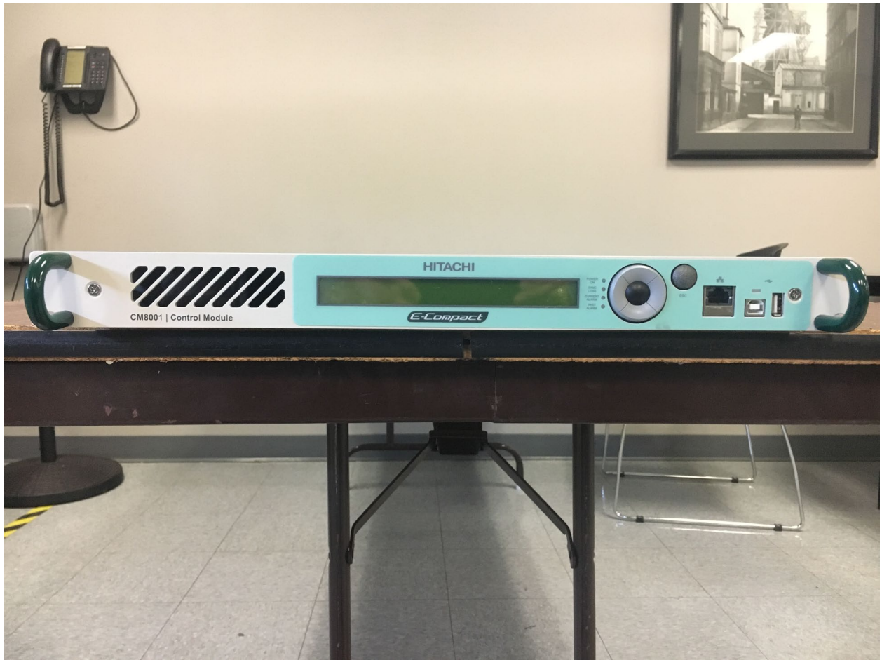
Figure 5. Transmitter Control Module Front View