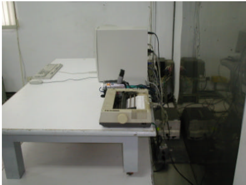
Conducted Emission Setup Photos (Worst Emission Position)