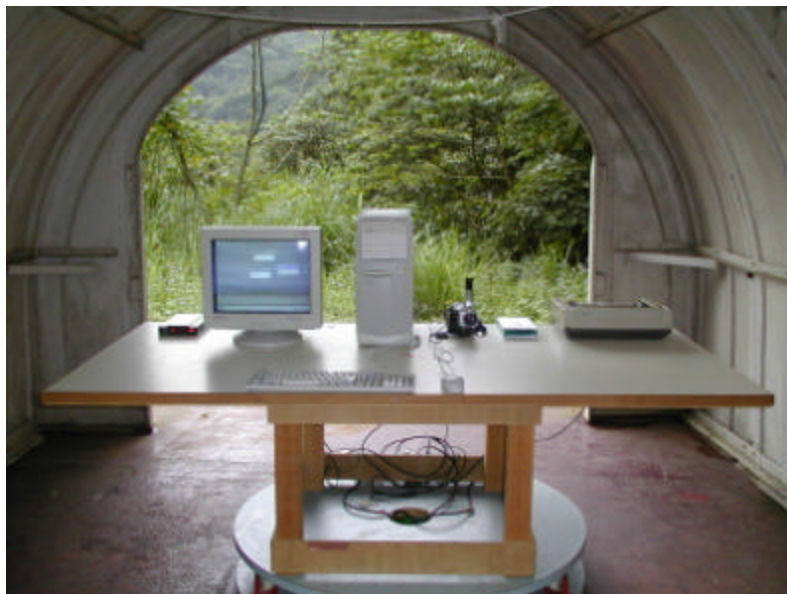
Radiated Emission Setup Photos (Worst Emission Position)