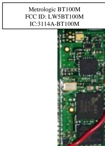
Figure 2 Proposed FCC/IC ID Label Location on BT100M Module