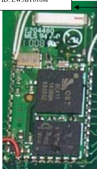
Figure 2 Proposed FCC ID Label Location on BT010M Module