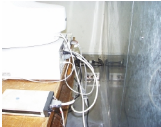
Conducted Emission Setup Photos (Worst Emission Position)