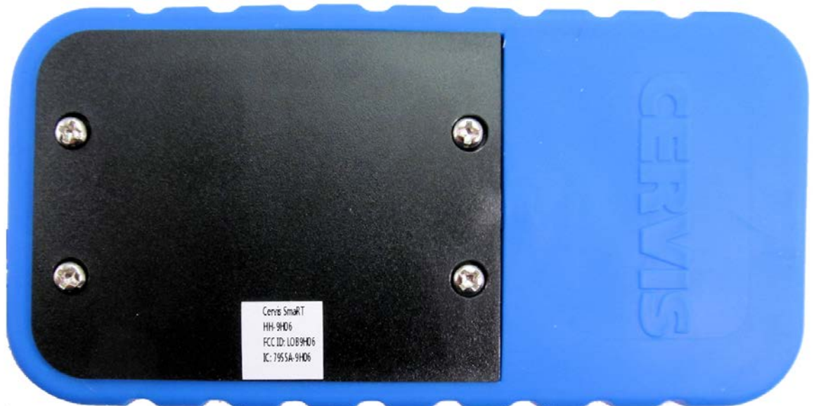
Fig. 3b: Label on enclosure exterior, no belt clip.