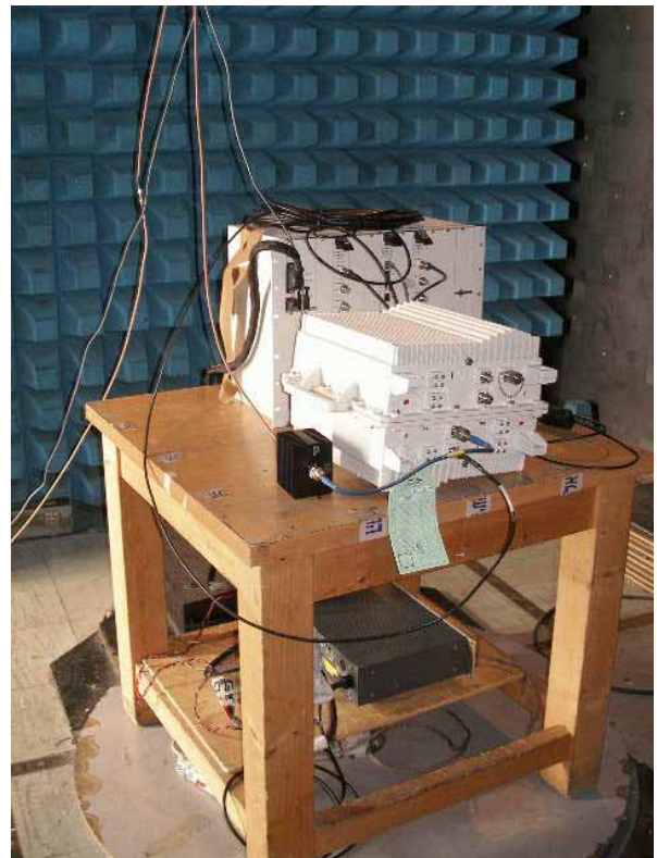
Test setup in anechoic chamber