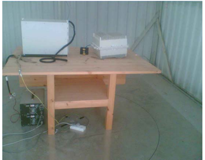
Test setup on OATS