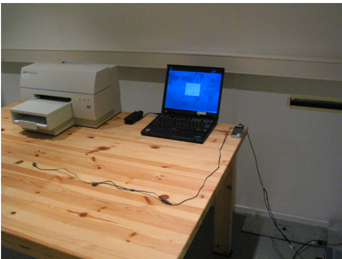
Picture 4 AC powerline conducted emission measurement 15B