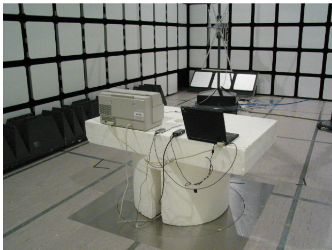
Picture 2 Radiated emission 15B