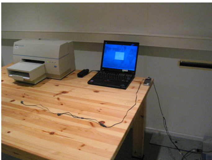
Picture 4 AC powerline conducted emission measurement 15B