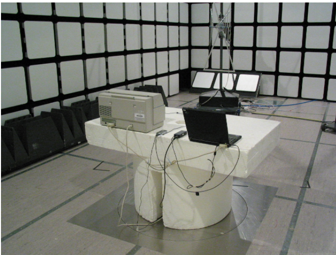
Picture 2 Radiated emission 15B