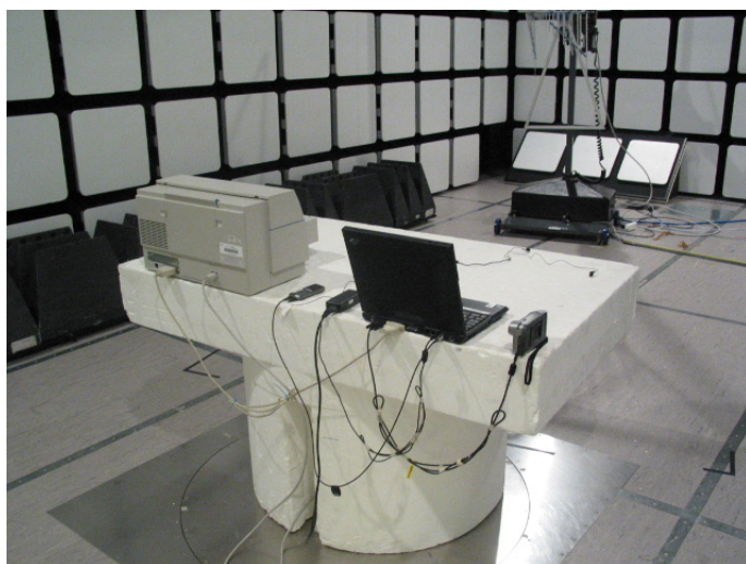
Picture 3 Radiated emission 15B