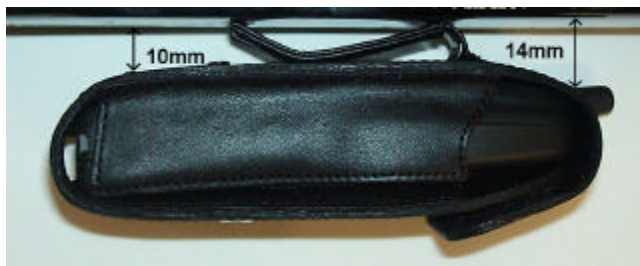
Picture 3. Separation distance with Leather Carry Sleeve CSL-5

Body-worn SAR was measured on lowest, middle and highest channel with the maximum output power level. Brain equivalent liquid was used in body-worn measurements.