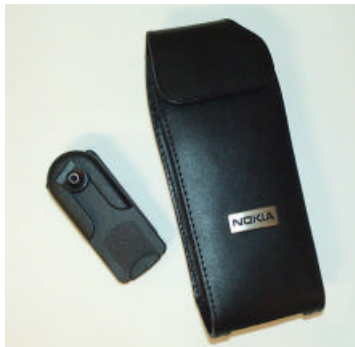
Picture 1. Belt Clip BCH-12U and Leather Carry Case CSL-5

SAR was measured when phone was placed with body worn accessories against the Flat Phantom. Body worn accessories Belt Clip BCH-12U and Leather Carry Case CSL-5 (Picture 1) were tested. The measurement test equipment and setup was the same as used in Head SAR measurements.