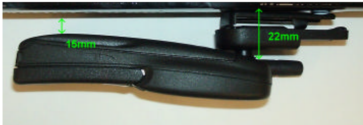
Picture 2. Separation distance with Belt Clip BCH-12U

Measurements were done with the Dasy 2 dosimetric assessment system DAE V2, SN: 213 and with the generic Twin Phantom version 3 from Schmid & Partner Engineering Ag. Positioning of the phone in all measurements were done according to the user guide instructions in section Radio Frequency (RF) Signals . Separation distance for BCH-12U is presented in picture 2 and for CSL-5 picture 3. The point of maximum SAR was searched and SAR was measured with a 3-dimensional cube measurement averaged over 1 gram mass.