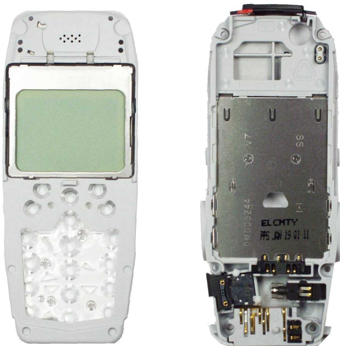
Exhibit 9: Internal Photographs