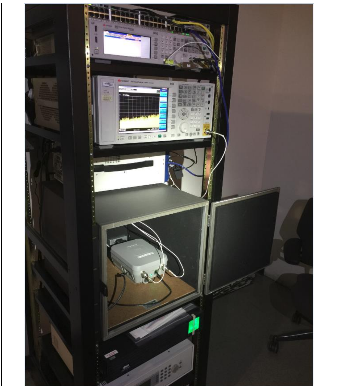
Title: Conducted Test Setup

This is a dual band 2.4GHz / 5GHz device. All ports in this test set up photo are connected as all testing is automated.