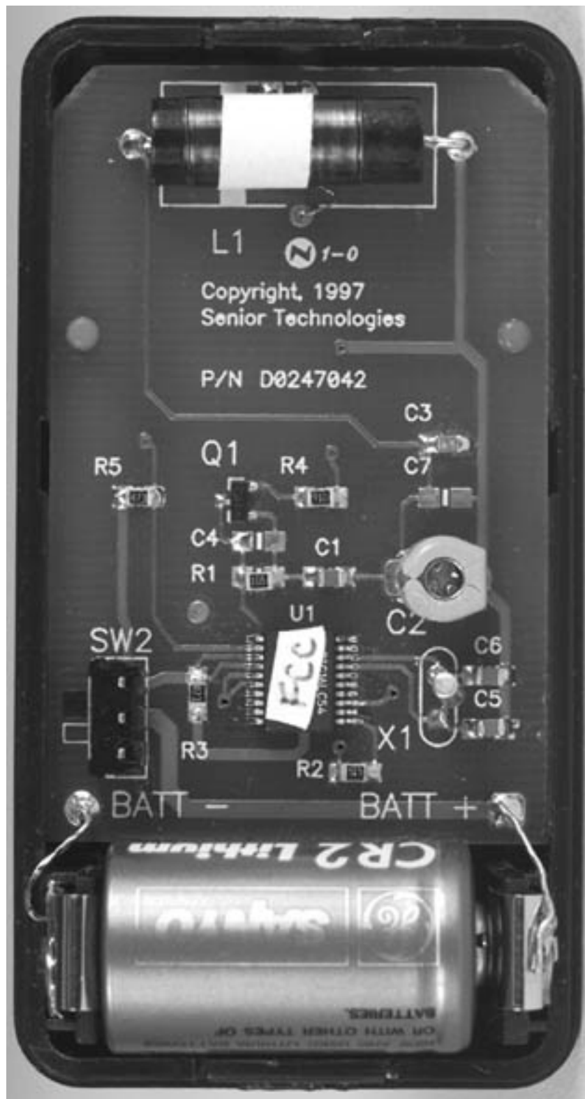
Figure 3 - PCB FRONT VIEW