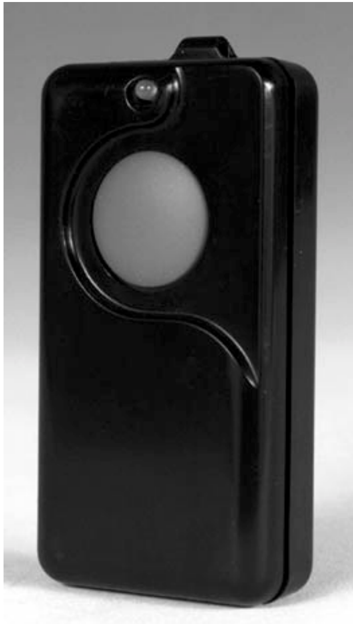
Figure 1 - EXTERNAL VIEW FRONT