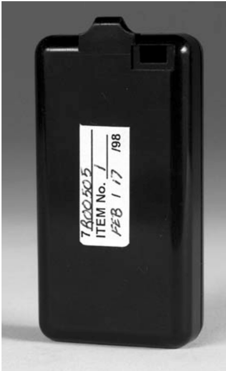
Figure 2 - EXTERNAL VIEW BACK SHOWING LABEL LOCATION